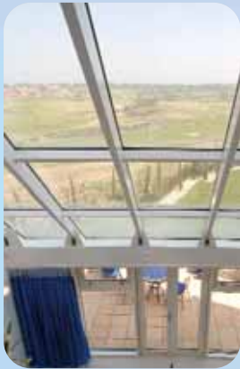
The Vistas, Cheshire. Countryside Properties.