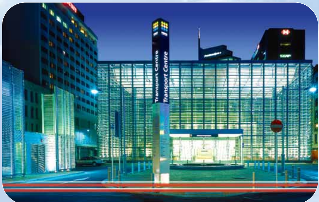
Britomart Transport Centre, Auckland.

For detailed information on any aspect of handling and processing Pilkington Activ™ , refer to our range of technical guidelines, visit www.pilkington.com or contact our Technical Advisory Helpline on 01744 692000 .