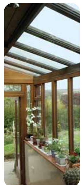
Domestic conservatory, Whitby.