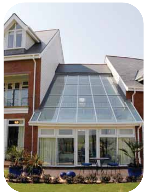
The Vistas, Wychwood Park. Countryside Properties 01270 821 0830.

A design feature of this private home near Chester, the atrium style roof to the central family room allows maximum light inside and offers stunning views from the galleried landing. By specifying Pilkington Activ ™ , the architect ensured that the glass always looks at its best, especially as cleaning access is so restricted.