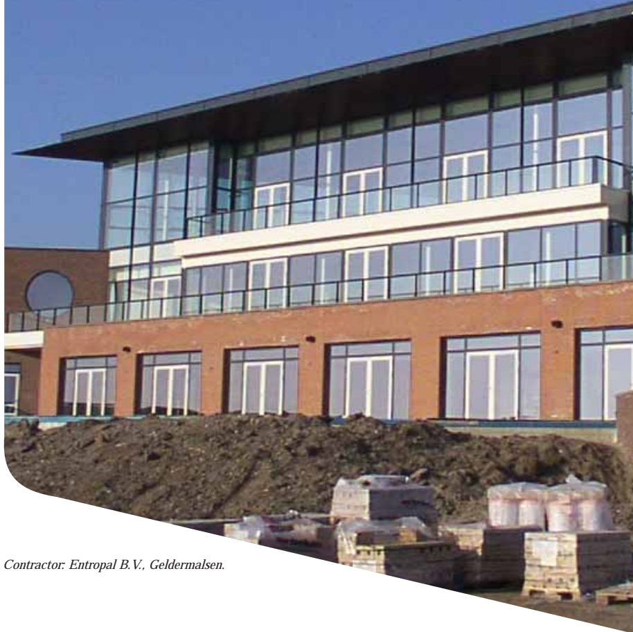
Contractor: Entropal B.V., Geldermalsen.

Pilkington plc hereby disclaim all liability howsoever arising from any error on or omission from this publication and for all consequences of relying on it. Pilkington Activ ™, Pilkington Activ Optitherm ™ SN, Pilkington Activ Suncool ™, Pilkington Activ Optilam ™, Pilkington K Glass ™, Pilkington Insulight ™, Pilkington Optilam ™, Pilkington Optilam ™ Phon, Pilkington Optitherm ™ SN, Pilkington Activ Stippolyte ™, and the Pilkington logo are trademarks of Pilkington plc .