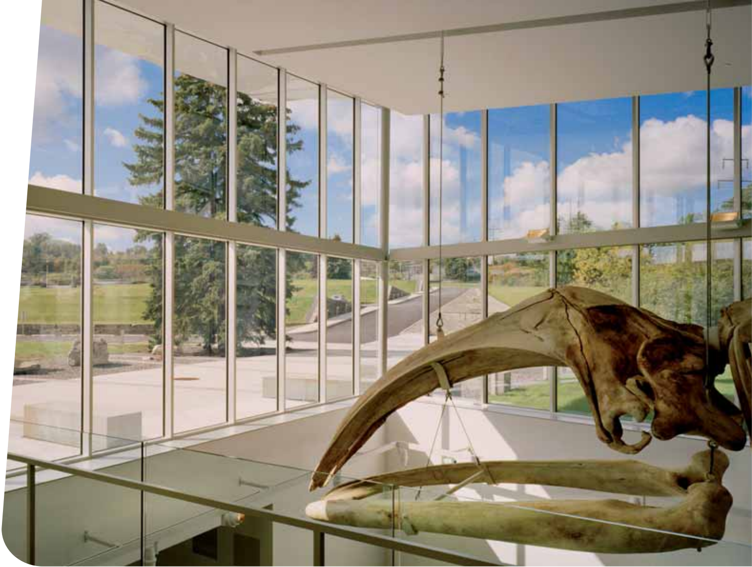
Museum of the Earth, New York.