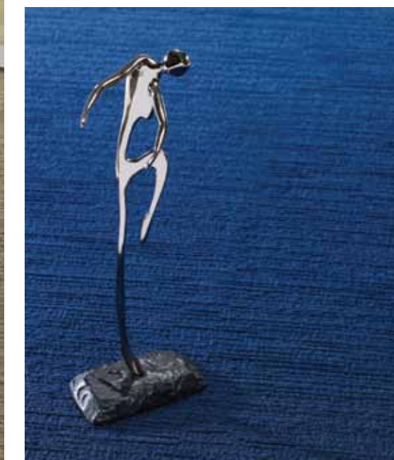
1502 danube laid textural