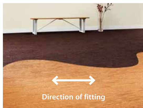
Colour: 1517 umber & 1511 coffee laid textural

Arran avoids the market place 'norm' of high contrast colours to create the look of texture and instead boasts a broad tone-on-tone colour bank.