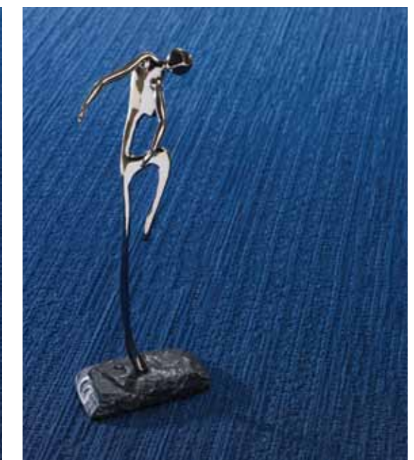
1502 danube laid linear