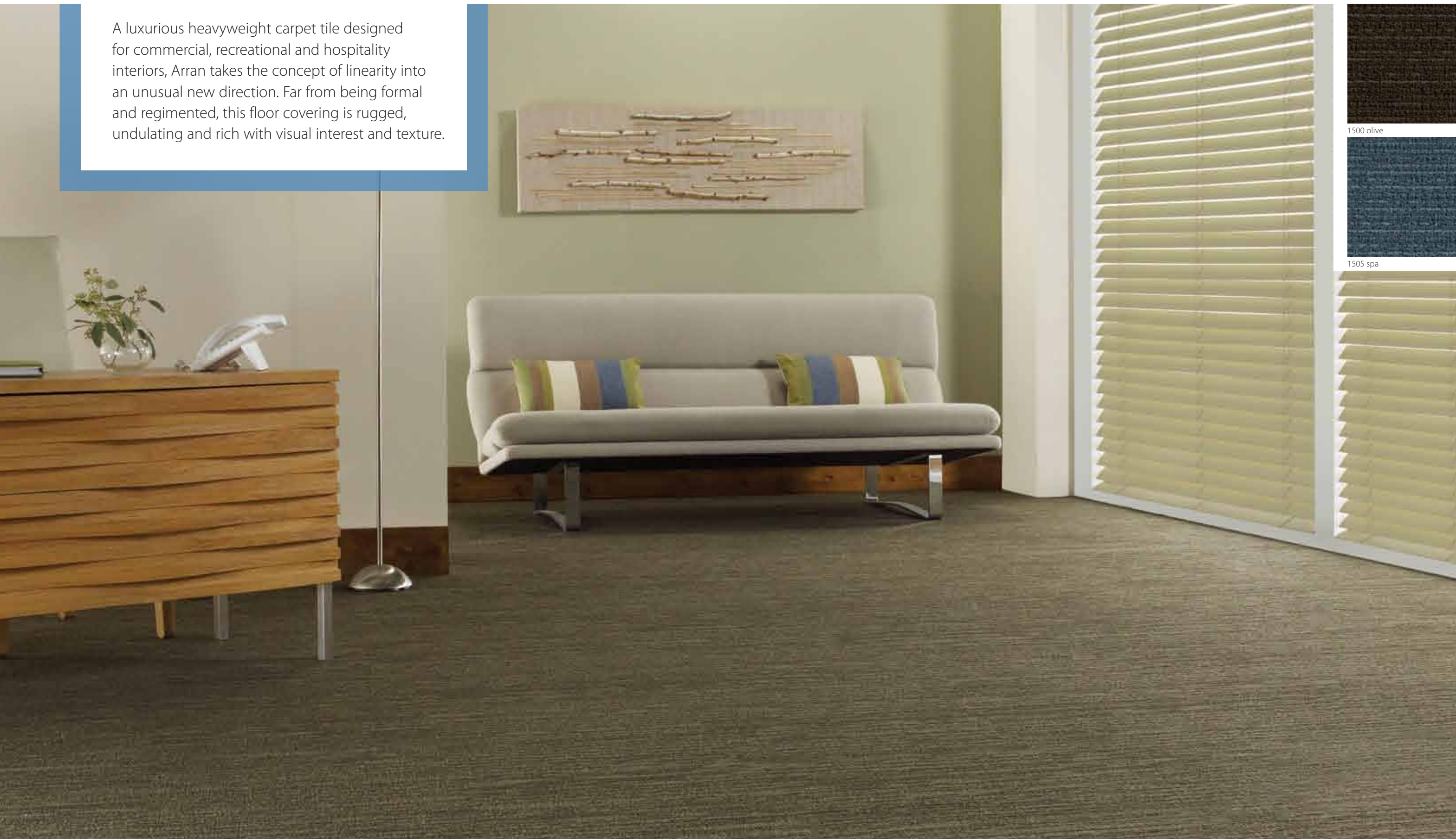
1500 olive laid textural

A luxurious heavyweight carpet tile designed for commercial, recreational and hospitality interiors, Arran takes the concept of linearity into an unusual new direction. Far from being formal and regimented, this floor covering is rugged, undulating and rich with visual interest and texture.