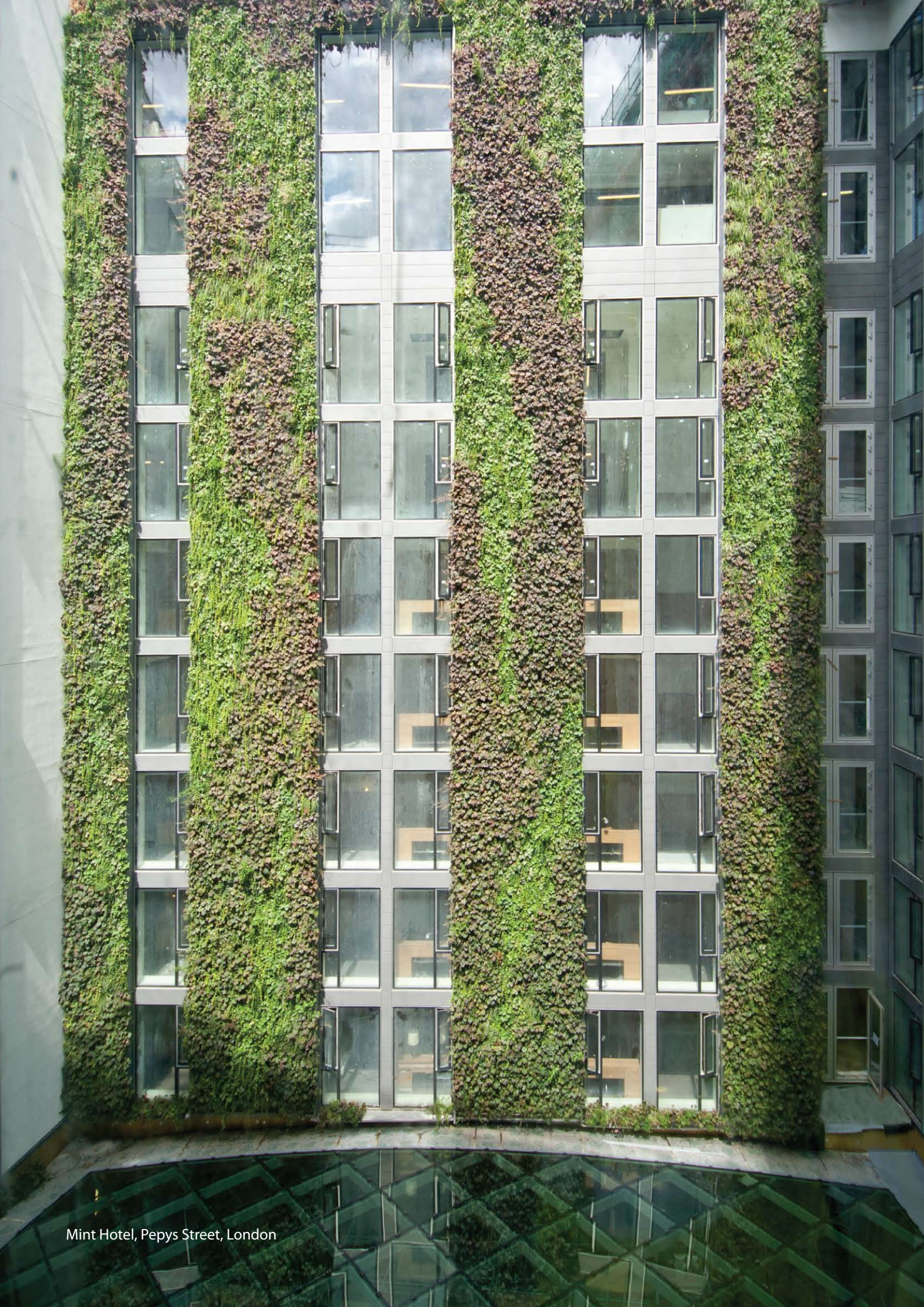
Mint Hotel, Pepys Street, London