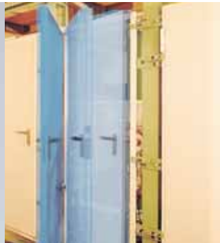
Ongoing functionality test

New developments and enhancements are tested in internal tests at our fire centre to see if they meet the fire-resistance standards required. The knowledge gleaned from these tests provides a high measure of security for protecting facilities from fire. The optimum requirements for the official tests carried out at certified testing centres for issuing official permits are created in these tests.