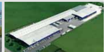
Hörmann Gadco LLC, Vonore TN, USA

Hörmann is the only manufacturer worldwide that offers you a complete range of all major building products from one source.