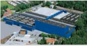
Hörmann KG Amshausen