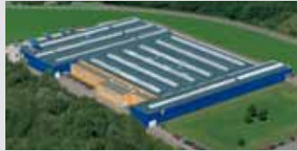
Hörmann KG Eckelhausen