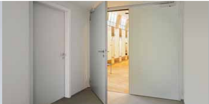
Multi-function steel doors

Hörmann delivers a wide range of fully-glazed, smoke-tight, T30 and T90 tubular frame parts. You can choose between three different models: the steel S-line, steel N-line and aluminium. All of these models are matching in appearance and available to a maximum height of 4.5 m. The side assemblies make an infinite number of widths possible.