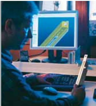
Proprietary product development

Door functions demand continual new developments and improvements in construction and fittings. Our qualified development teams have proven their ability time and time again with their broad range of specialist skills. Hörmann has continued to extend its product programme, resulting in today's complete range.