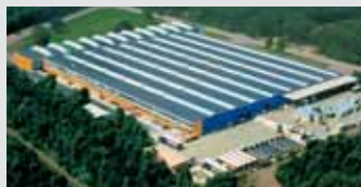
Hörmann Genk NV, Belgium