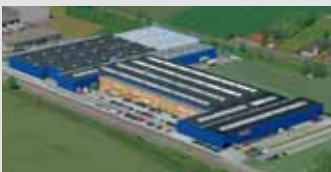
Hörmann KG Werne