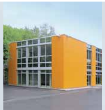
Seminars: Fire Protection Centre in Freisen

Experienced expert advisers at our sales organisations in your region advise you in all matters concerning the facility from the planning stage and clarifying technical matters to the final building inspection. Professional and expert door element fitting is guaranteed by experienced Hörmann fitters and specially trained staff.