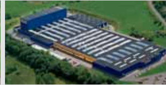
Hörmann KG Freisen