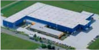
Hörmann KG Dissen