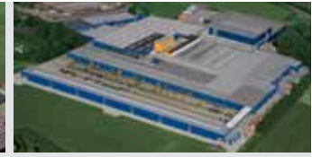
Hörmann KG Brockhagen