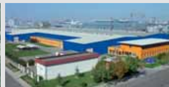
Hörmann Beijing, China