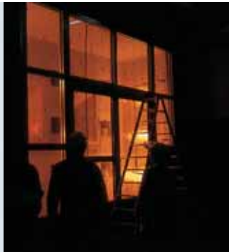
Advance tests in Hörmann's own fire-testing House

Door functions demand continual new developments and improvements in construction and fittings. Our qualified development teams have proven their ability time and time again with their broad range of specialist skills. Hörmann has continued to extend its product programme, resulting in today's complete range.