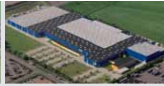
Hörmann KG Brandis