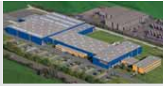
Hörmann KG Antriebstechnik