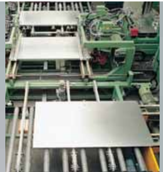
Highest quality products

Functional mechanical efficiency is an essential mark of quality for facility doors as well as their protective function. Comprehensive material tests performed during ongoing functionality tests ensure years of perfect functioning when the doors are serviced appropriately. Besides testing the prerequisite closing cycles, special elements on doors are also tested to the limit.