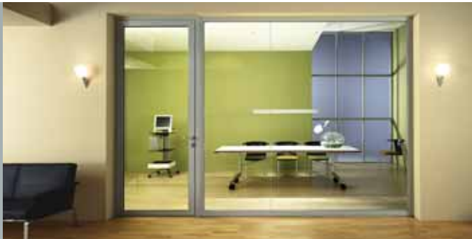
Fully-glazed fire and smoke protection elements

Hörmann delivers a wide range of fully-glazed, smoke-tight, T30 and T90 tubular frame parts. You can choose between three different models: the steel S-line, steel N-line and aluminium. All of these models are matching in appearance and available to a maximum height of 4.5 m. The side assemblies make an infinite number of widths possible.