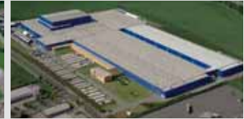
Hörmann KG Ichttershausen