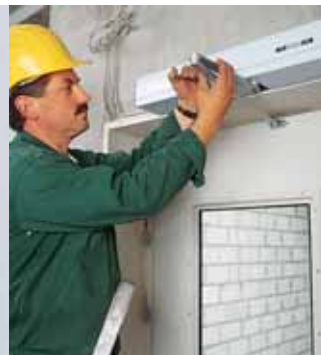
Specialist facility consulting

Besides external monitoring as a part of quality assurance tests, our workforce secures very high quality standards in production and quality control. During day-to-day production our door elements are continually tested for functioning and processing quality by taking random samples.