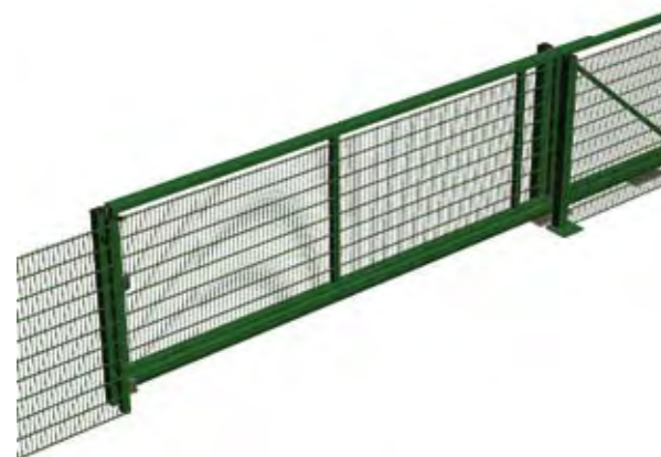
Precision engineering allows for smooth safe opening of trackless gate.

Zaun's Sapphire sliding gates use a trackless cantilever system. We can manufacture the gate to any width you require up to a 10m opening, making this system ideal for retro-fitting to existing entrances. The gates can accommodate a wide range of infills, meaning that it may be possible to match any fencing or railings that already exist on your site. Sapphire sliding gates are supplied as manual, but can be automated by the customer.