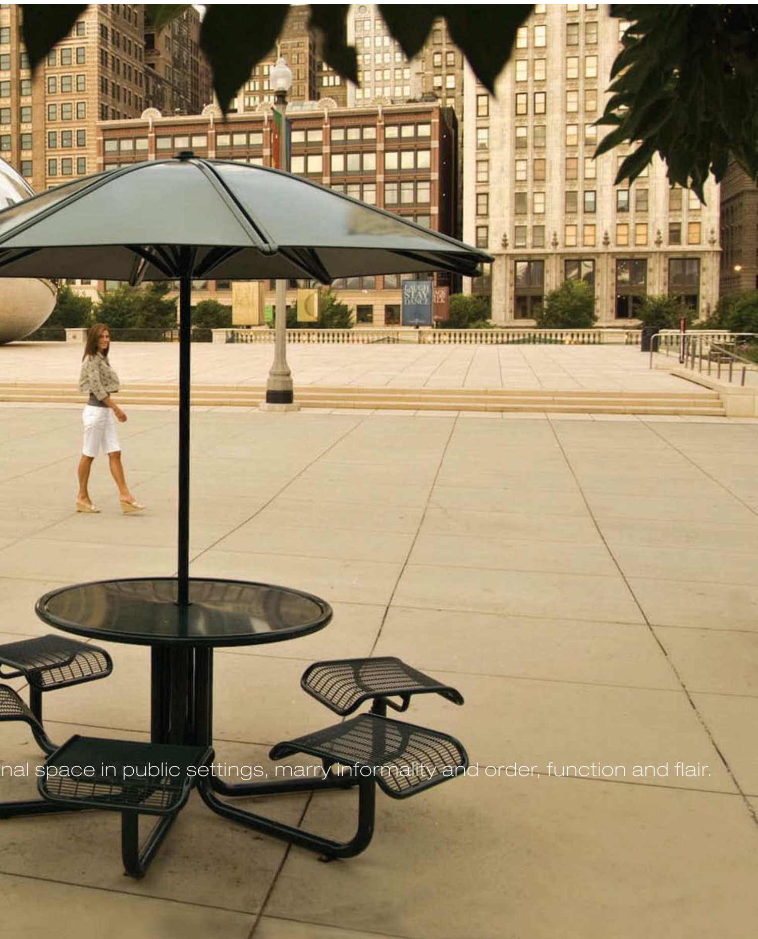
nal space in public settings, marry informality and order, function and flair.