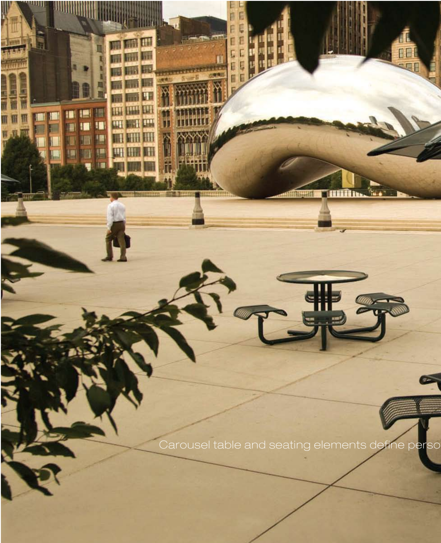
Carousel table and seating elements define perso