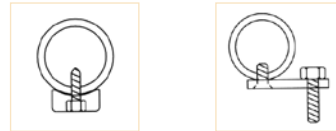
freestanding with glides

Three-seat style must be surface mounted. Four, five and six seat styles may be freestanding with glides or surface mounted. All tables must be surface mounted when used with Solstice or Shade umbrellas.