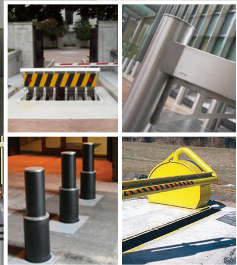
112mm/ 4.409in The actual depth of our super shallow foundations.