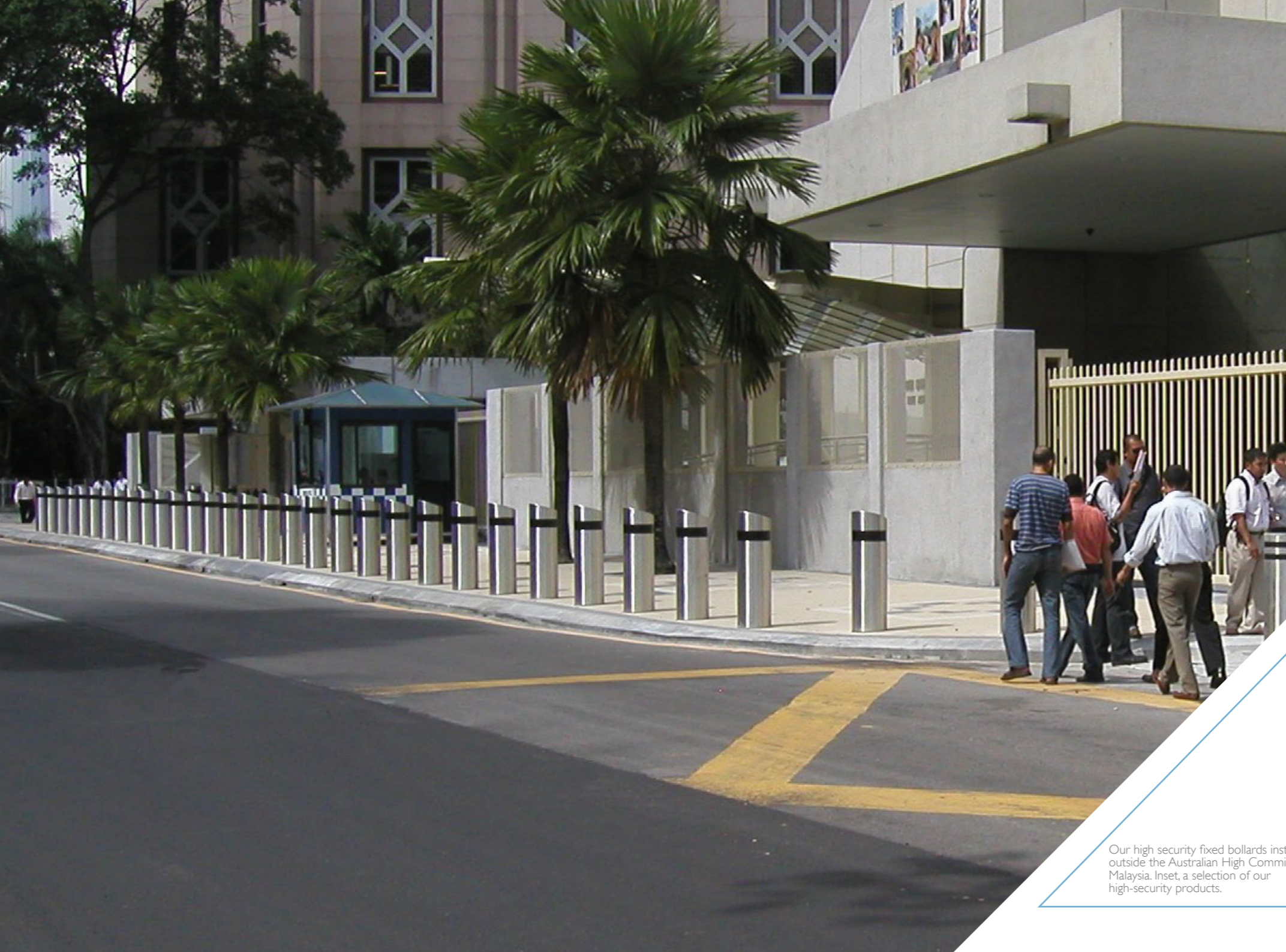
Our high security fixed bollards installed outside the Australian High Commission, Malaysia. Inset, a selection of our high-security products.