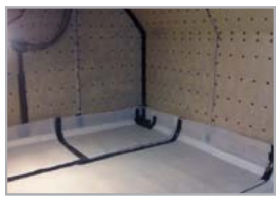
The cavity drain option is recommended as

Newton Basedrain drainage channel is placed at the joint of wall and it is fully maintainable and repairable slab and connects to either a pumping system or to safe gravity drainage to allow for water to be safely removed from the structure.