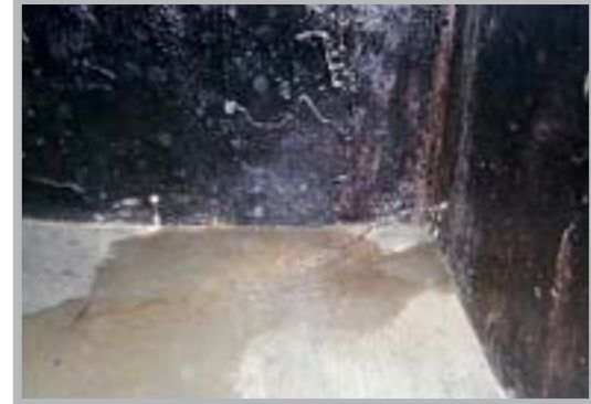
Here bitumen paint has been applied as the tanking solution, and it has clearly failed

Barrier membranes need to lap from wall to floor to like a tank (hence tanking) and require the structure to be physically capable of resisting the increase in water pressure. Many barrier systems fail due to movement of the structure due to water pressure exerting forces to the walls and slab.