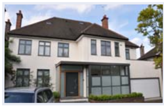
Renovating a basement to give more living space

Installation by a Newton Specialist Basement Contractor gave the client peace of mind of an insured backed guarantee and the specifier was also able to delegate full PI on design for the structural waterproofing package.