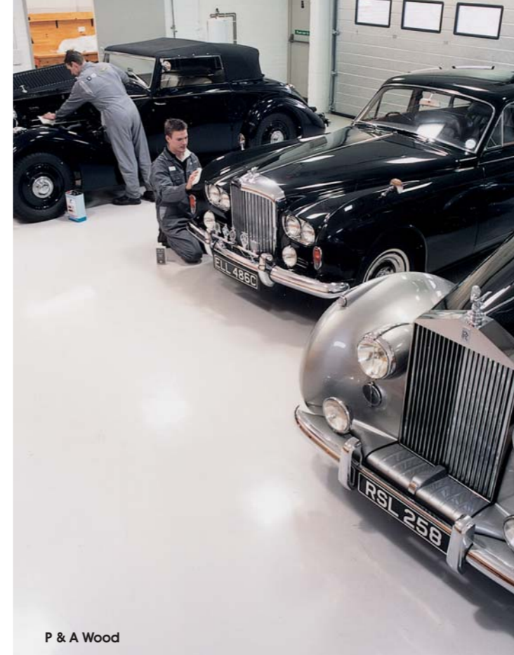
P & A Wood