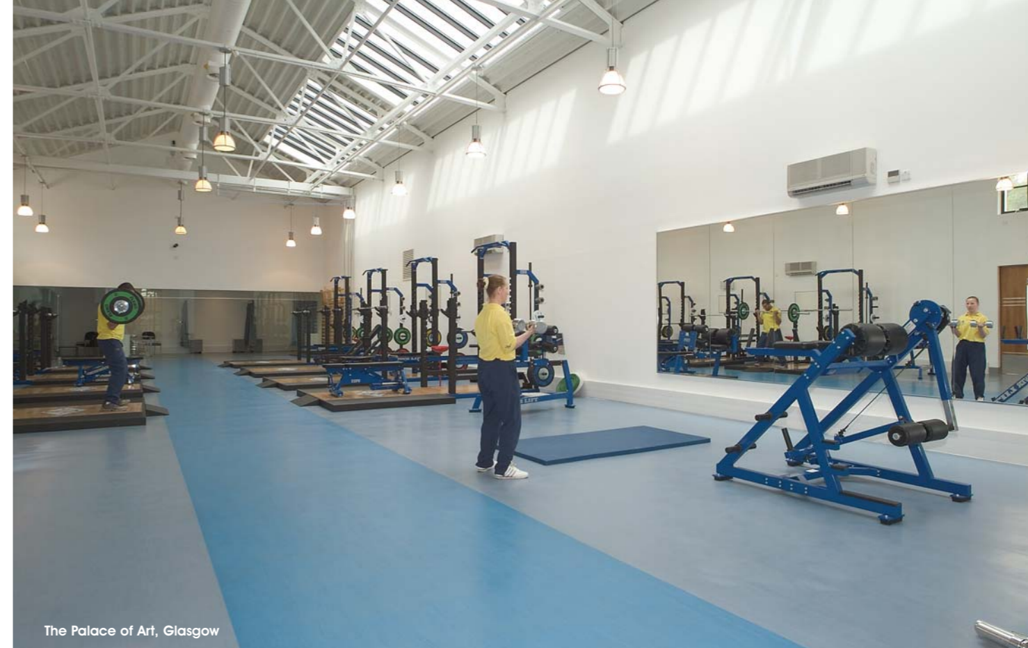
The Palace of Art, Glasgow