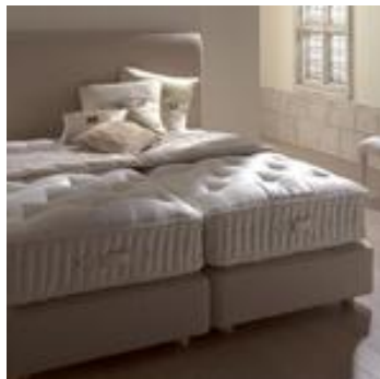
Pembroke Mattress and Divan