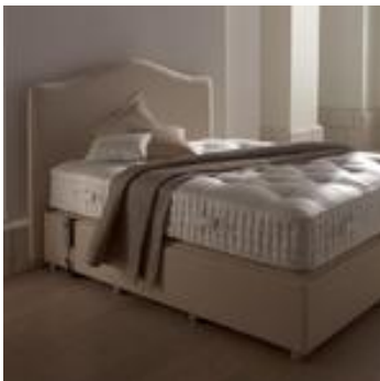
Nuffield Mattress and Divan

See more related products below. Find out more at your nearest showroom.