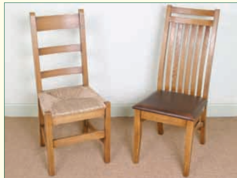
FARMHOUSE WITH RUSH SEAT