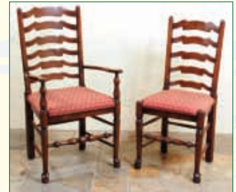
LADDERBACK WITH DROP-IN UPHOLSTERED SEAT