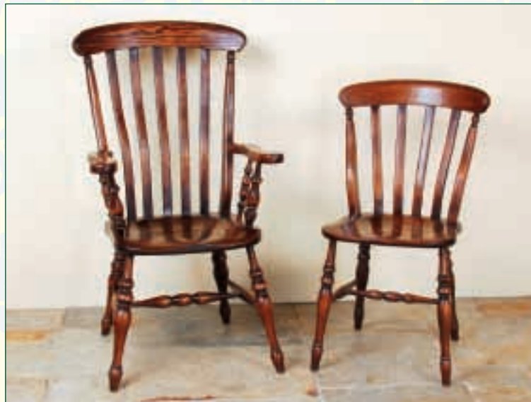
ASH LATHE BACK ARMCHAIR Ref: 359A SIDECHAIR