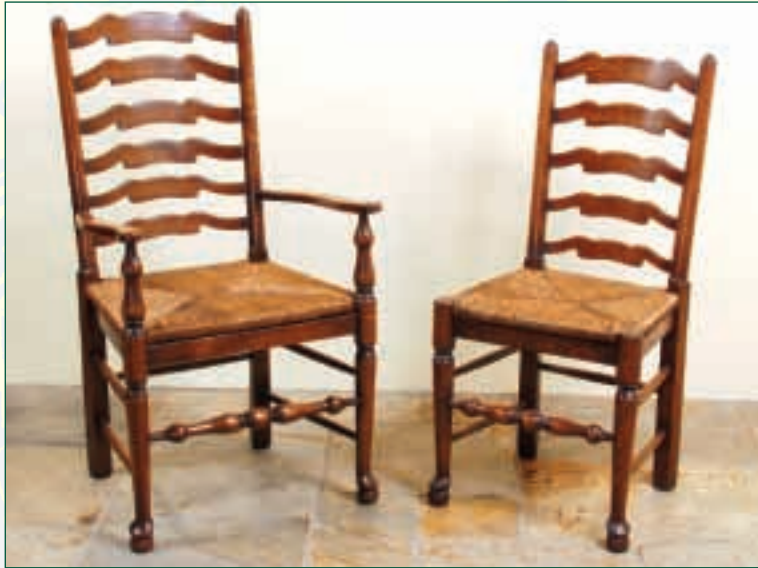
LADDERBACK WITH RUSH SEAT CARVER Ref: 355C SIDECHAIR