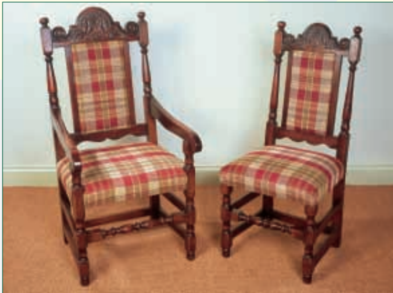
ELIZABETHAN CARVED CHAIRS with upholstered backs CARVER Ref: 343C SIDECHAIR Ref: 343S