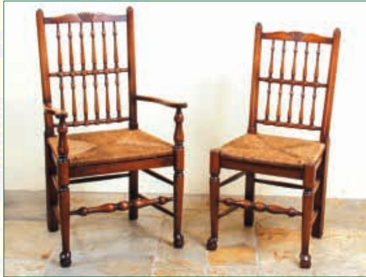
SPINDLEBACK WITH RUSH SEAT CARVER Ref: 357C SIDECHAIR