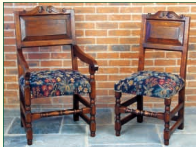
JAMES I UPHOLSTERED PANEL BACK