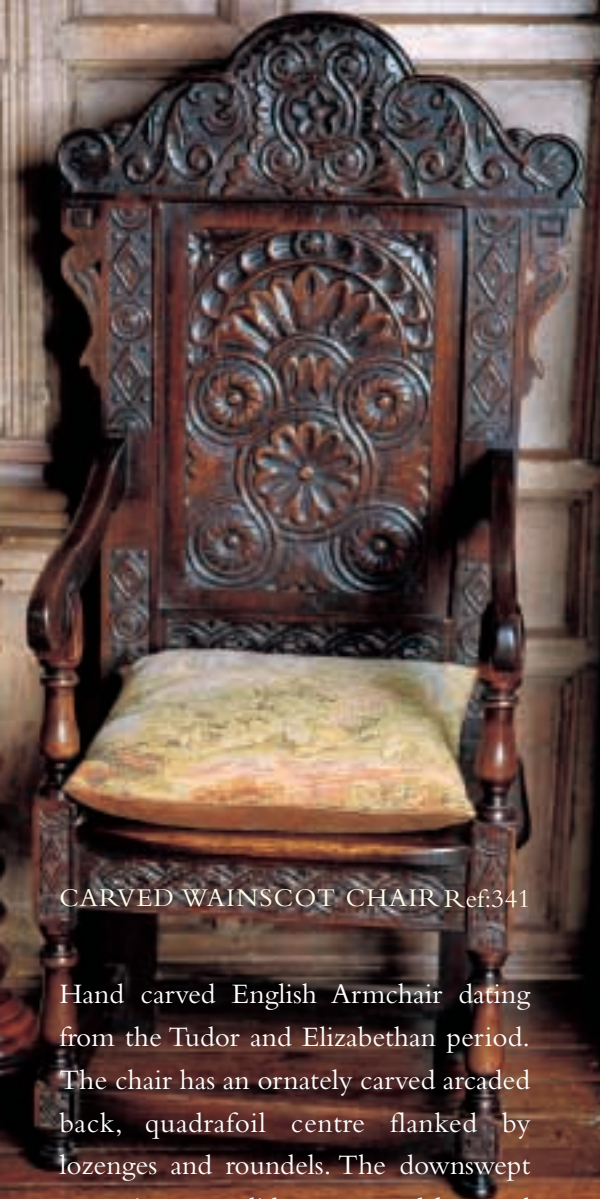
CARVED WAINSCOT CHAIR Ref:341

Hand carved English Armchair dating from the Tudor and Elizabethan period. The chair has an ornately carved arcaded back, quadrafoil centre flanked by lozenges and roundels. The downswept arms sit on a solid seat, turned legs and joined by stretchers.