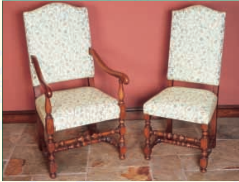
UPHOLSTERED CHARLES II CHAIRS CARVER Ref: 342C SIDECHAIR Ref: 342S