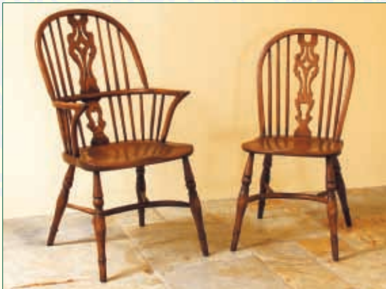
ASH GEORGIAN STICKBACK ARMCHAIR Ref: 353A SIDECHAIR