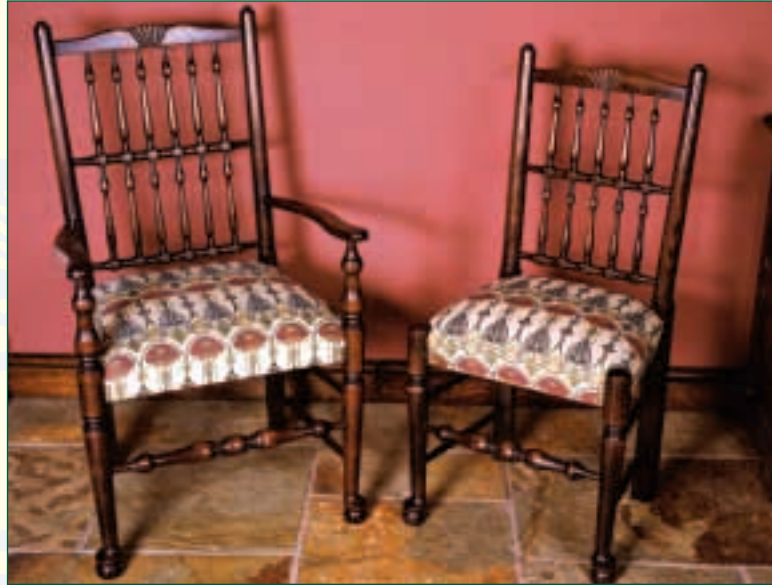
SPINDLE BACK CHAIRS WITH UPHOLSTERED BASES CARVER Ref: 357CSO SIDECHAIR Ref: 357SSO