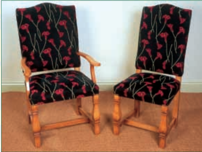
SQUARE CUT BALUSTER UPHOLSTERED CHAIRS CARVER Ref: 347C SIDECHAIR Ref: 347S