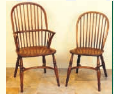
ASH STICK BACK ARMCHAIR SIDECHAIR