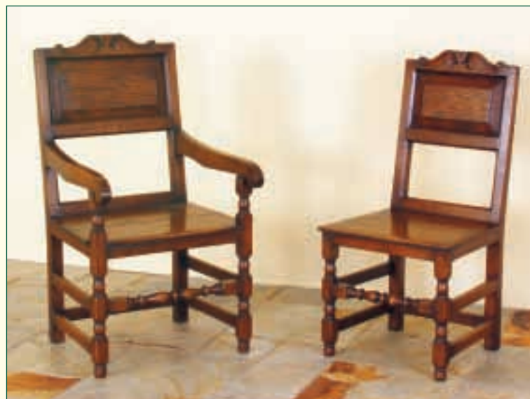
JAMES I PANEL BACK