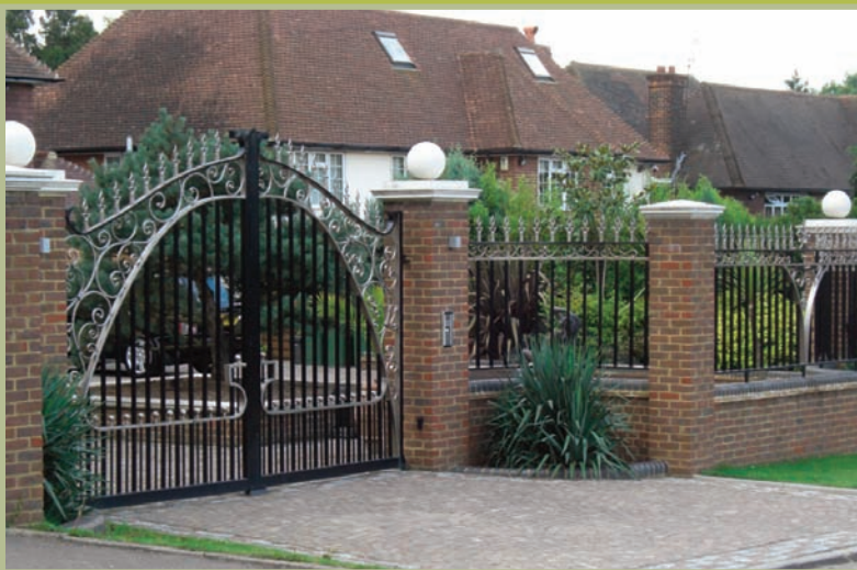
Decorative Gates and Railings, bespoke design, fully automated with Intercom system.