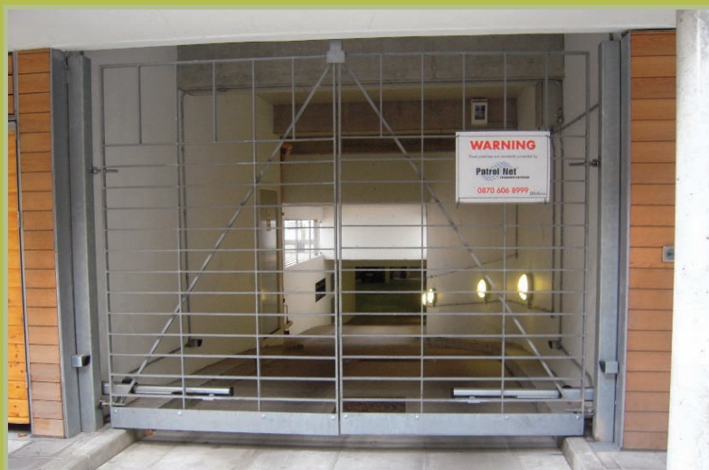
Galvanised double swing gates, automated by hydraulic rams. Manufactured to Architects design