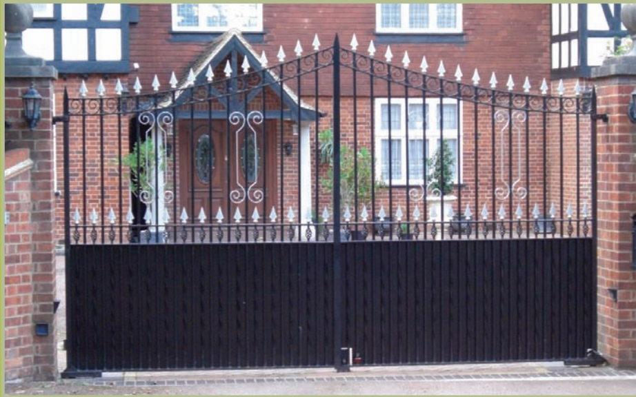
Gates with privacy panel, dog bars with below ground operators and gold painted infills. Harling 'Albert' design