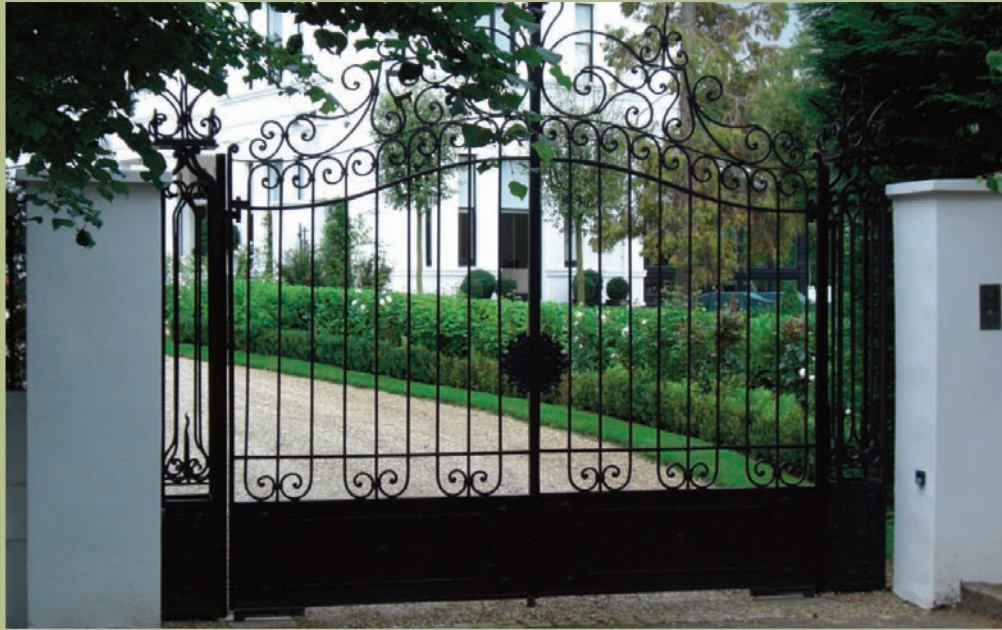
Grey powdercoated steel gates made to suit customers own design, automated with below ground operators