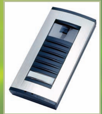
Targha video panel for an Intercom system