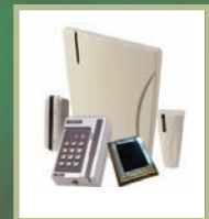
Readers and automation accessories