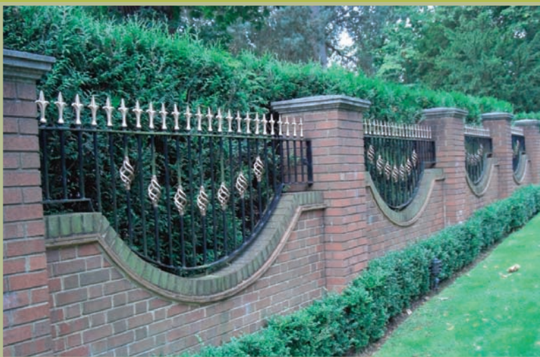
Decorative Railings, that were manufactured to match a pair of gates, a basic railing design with finials on top and twist scrolls in the centres.