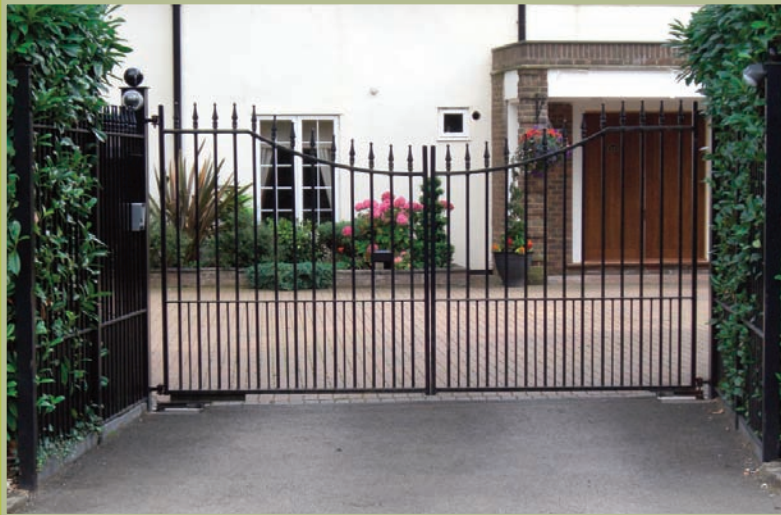
Automated Gates and Railings with basic railing design and dog bars at the bottom