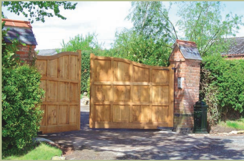
Automated wooden gates, with hardwood panels. Oakdene design