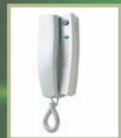
Internal handset for an Intercom system