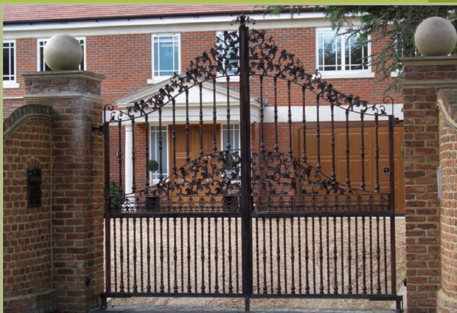
Gates with intercom system, powdercoated bronze, Harling 'Windsor Leaf' design