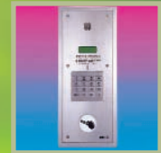
Digital Intercom panel