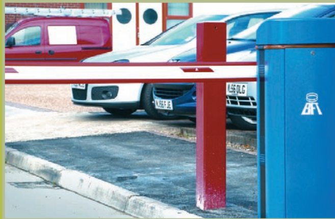
Automated Barrier with protective steel post installed next to it