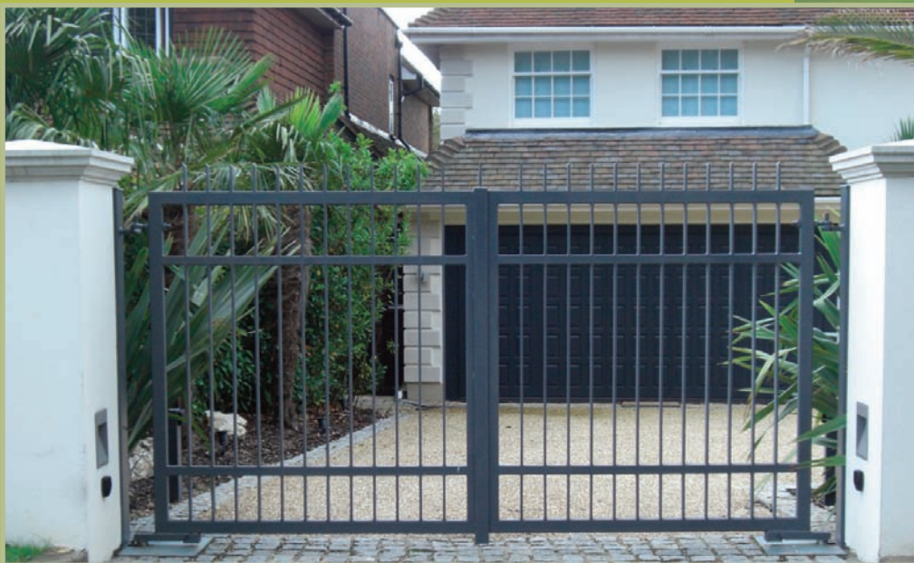
Grey powdercoated modern gates, with below ground operators. Harling 'Milton' design