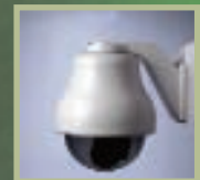
Wall mount vista dome