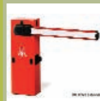
Automated Barrier available in a range of colours including stainless steel