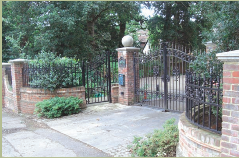
Steel gates with pedestrian gate and curved railings to match