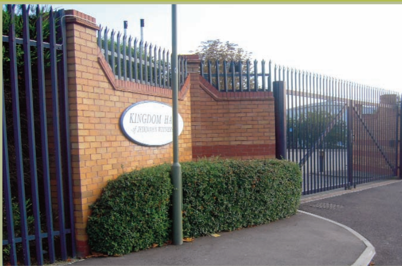
Pallisade fencing with manual gates to match, lockable by key.