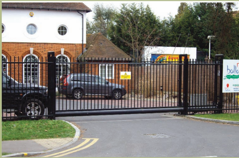
Harling 'Alley gate' design, sliding gate with cantilever action. This avoids having a ground track for the gate to run on.