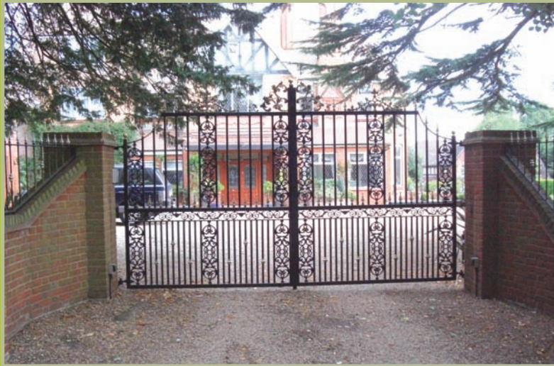
Traditional gates and railings, automated by hydraulic rams. 'Victoria' gate design