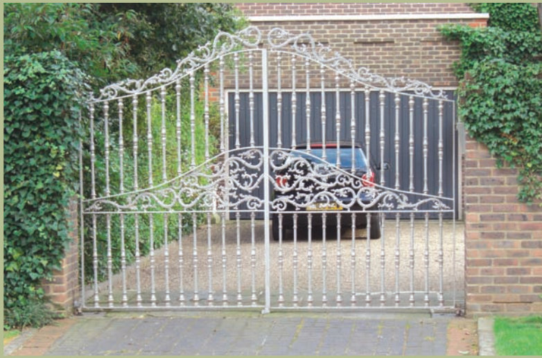
Decorative Gates powder coated silver for a residential project. Gates were a bespoke design