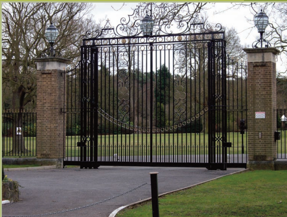
Large sliding gate with decorative infill, access control and traffic light system with ornate support posts and top arch. Gates were a bespoke design