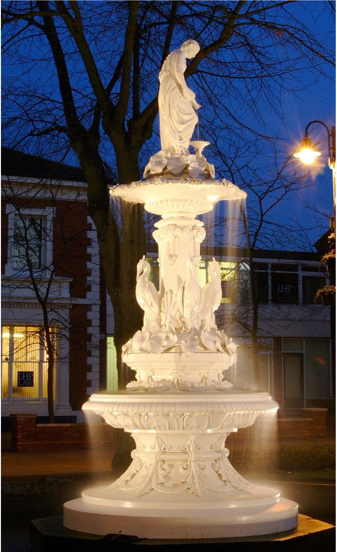
Looking good by night.