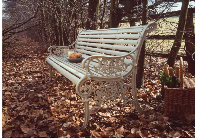
Seating and benches