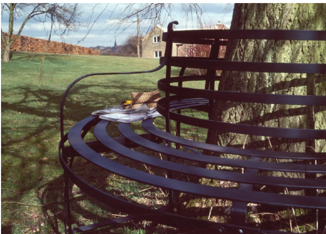
Bespoke landscape furniture