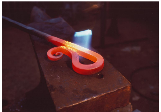
Blacksmithing and whitesmithing

1 Yewdale Crescent Wigan Lancashire WN6 7HD