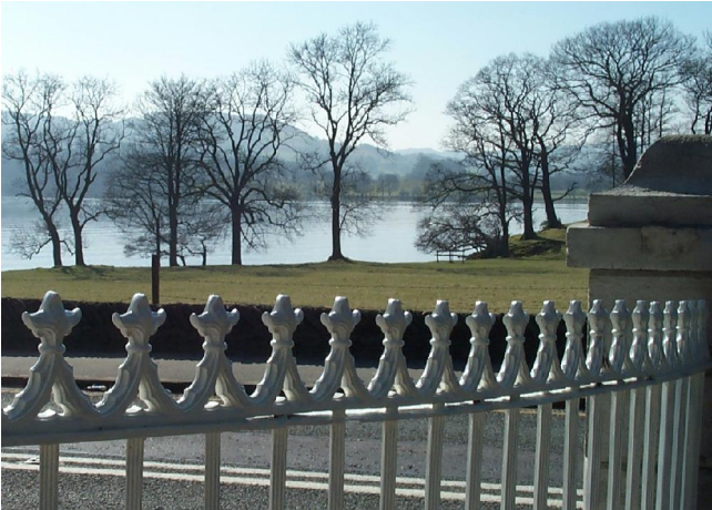
Fencing and railings