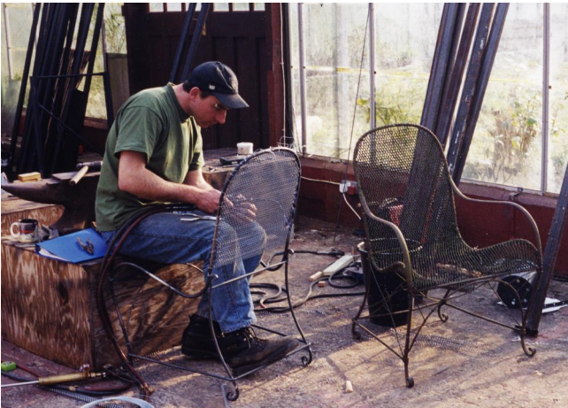
Cast and wrought iron