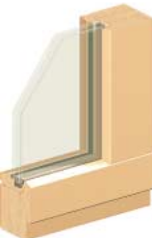
Fixed light, viewed from outside