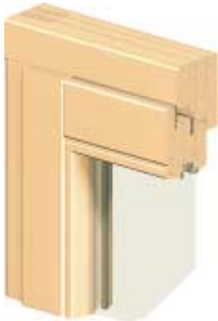
T&T, viewed from inside

The Skaala T&T windows are always tailor-made, not only for new houses but also for old buildings in need of restoration. For your windows you can choose any dimensions, forms or colours.