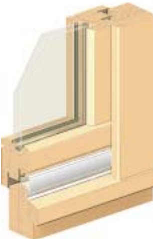
T&T, viewed from outside