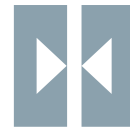
Panel Thickness: 31 – 46dB, 65mm 48dB, 100mm

The timber constructed panels have flush fitting protective aluminium edge profiles and the panel faces are available in a variety of finishes; painted, wood veneer, or a wide range of melamine or high pressure laminates.