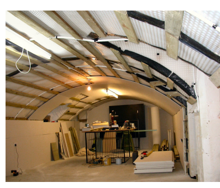
Basement Waterproofing Works in progress

Timberwise recommend that all basement installations receive an annual 'Check & Clean' to ensure that the waterproofing system remains in peak condition.