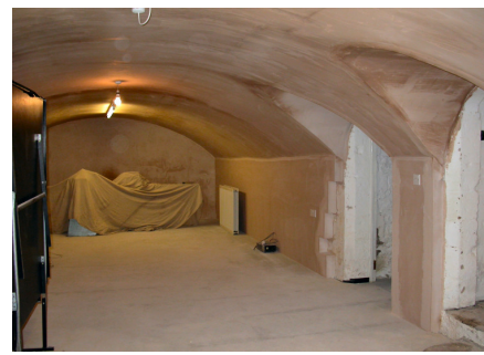
Completed Basement Waterproofing works awaiting decoration