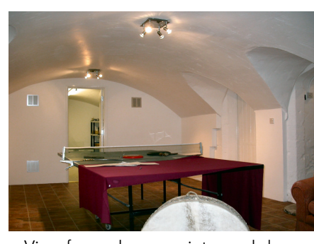
View from playroom into workshop