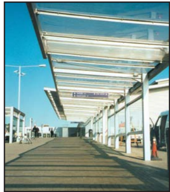
Luton Airport - Luton