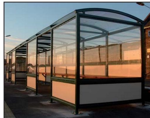
Sellafield Bus Shelter