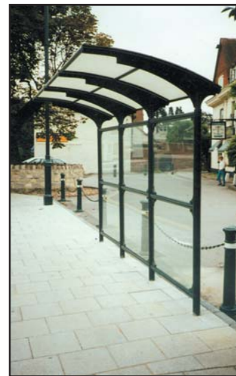
Civic Delta Shelter