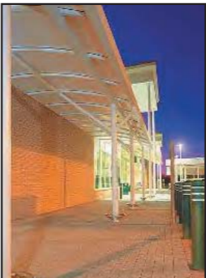
Asda - Telford