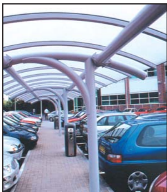
NPower - Oldbury