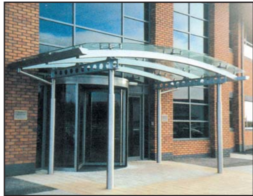
Royal Doulton - Stoke-on-Trent