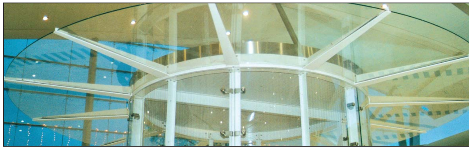
Midsummer Place - Milton Keynes