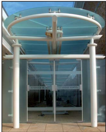
School - Isle Of Wight