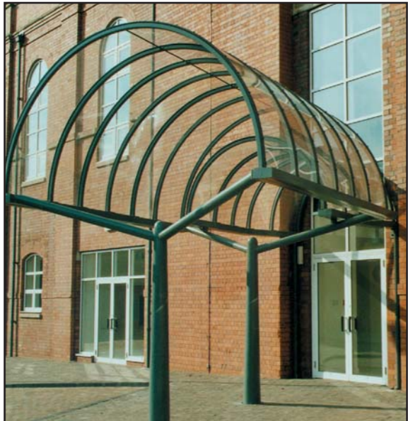
Deva Centre - Salford