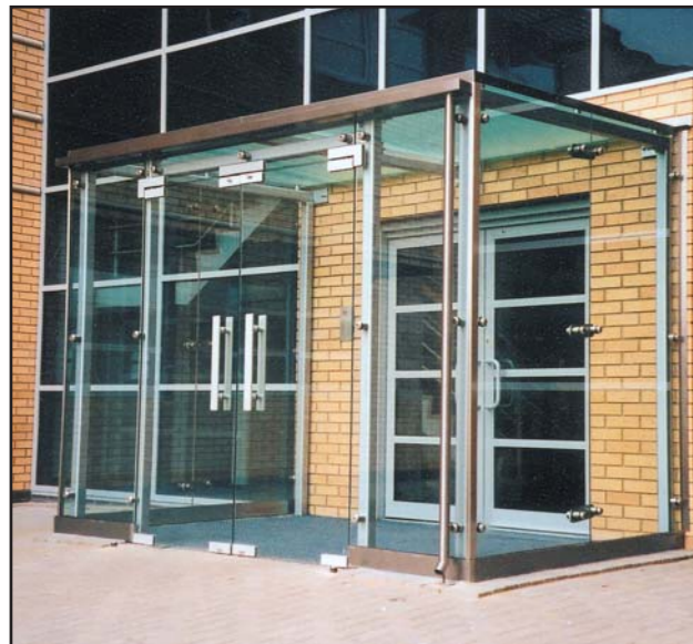
Cranfield - Milton Keynes