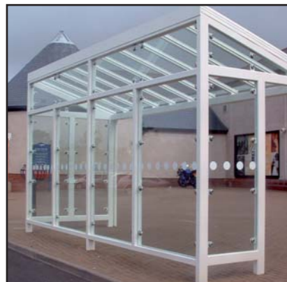
Gretna - Gateway