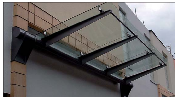
Kings Lynn Town Centre