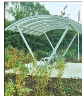
Free Standing Cycle Shelter