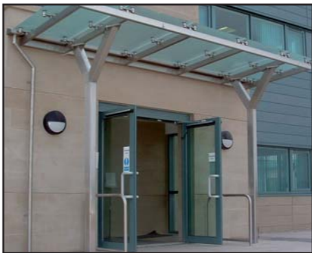
Canopy - Wakefield