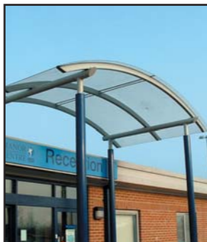
Manor Park - Nottingham