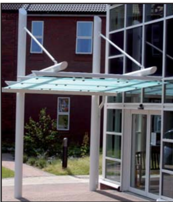
Hospital - Wrexham