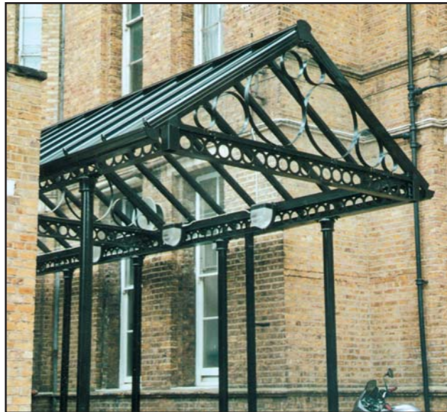
St. Charles Hospital - London