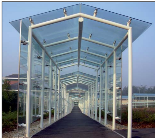
Walkway - Leicester