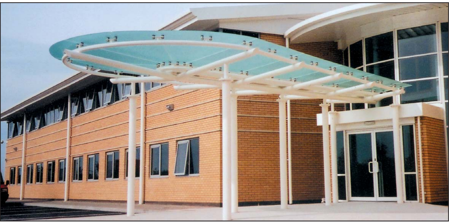
Cranfield - Milton Keynes