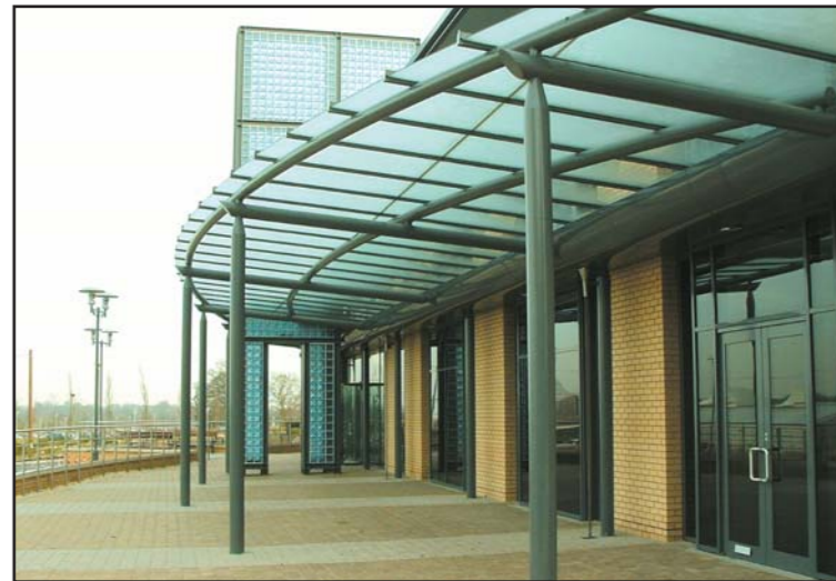
Blythe Valley - Birmingham