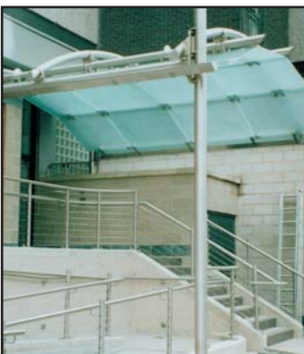
Pond Street - Sheffield