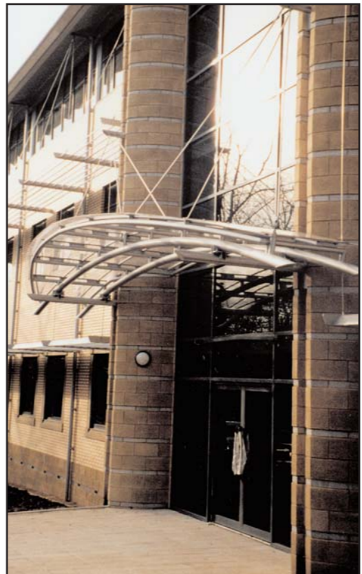
Barclays HQ - Leicester