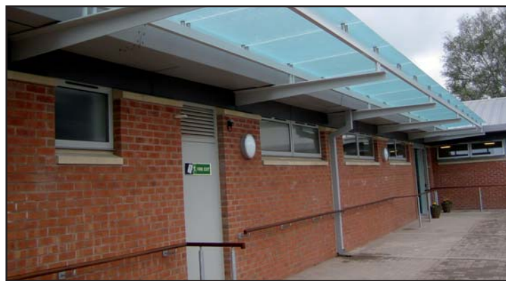
Surgery - Nottingham