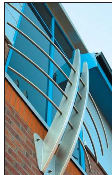
Morrisons - Redcar