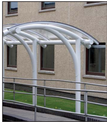
Walkway - Edinburgh