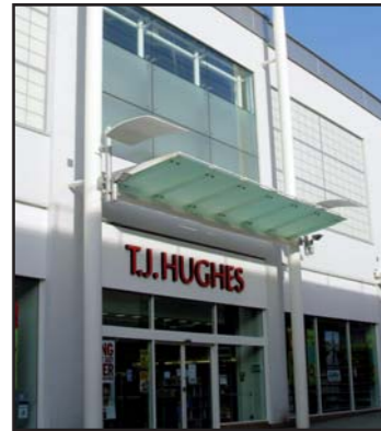
Kings Lynn Centre