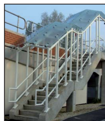
Staircase - Basingstoke