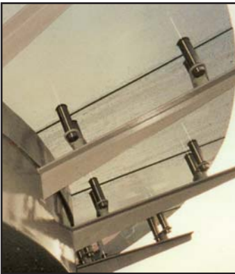
Crewe Hall Hotels - Crewe