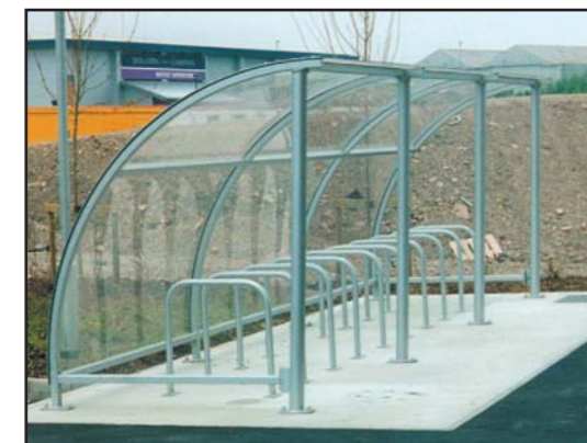
Covered Cycle Shelter