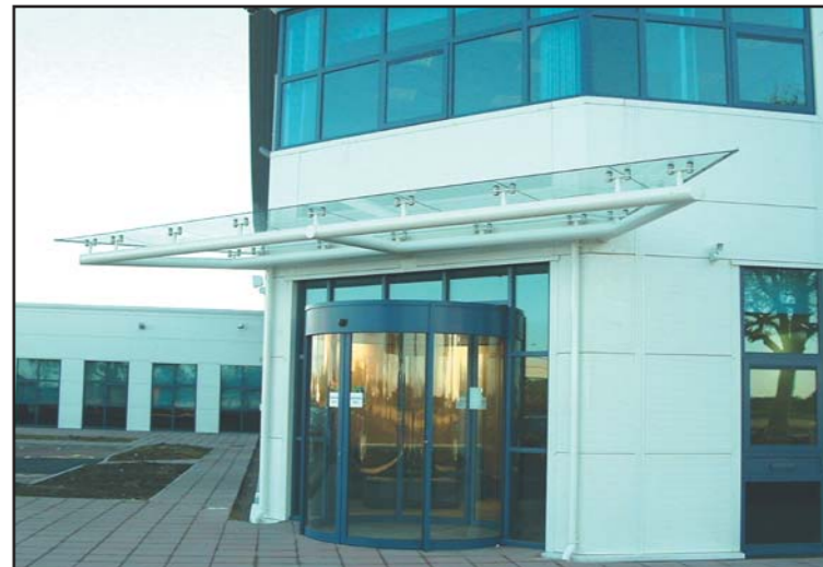
Trelleborg - Leicester