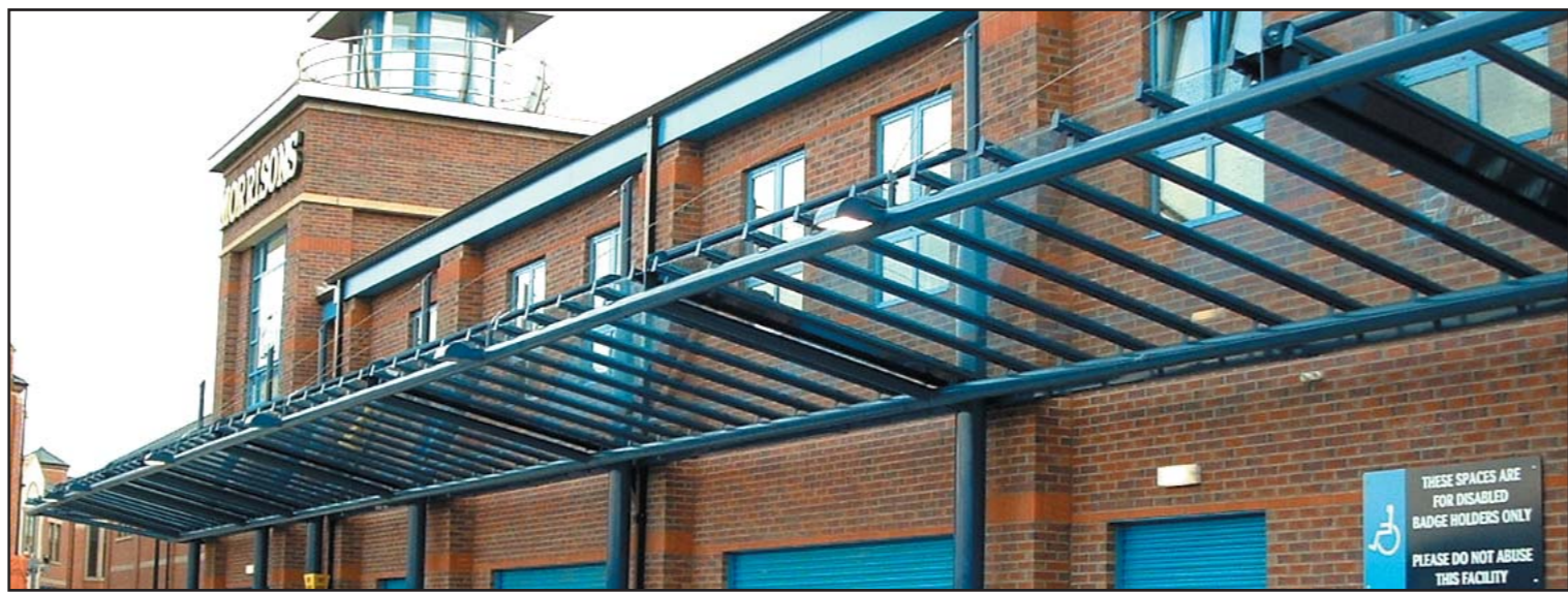
Morrisons - Redcar