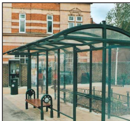
Shepshed - Loughborough