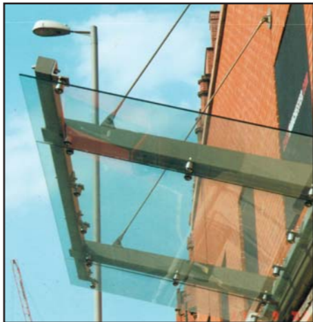
Life Cafe - Manchester