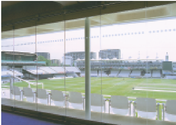
Lord's Cricket Ground, London

precision-made, DORMA HSW glass sliding walls are equally suitable for both modernisations and new buildings.