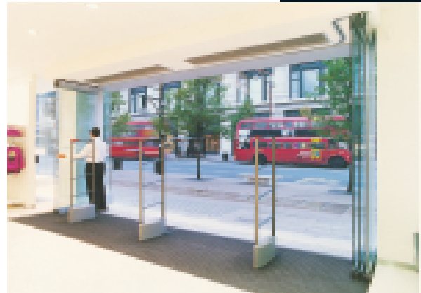
United Colours of Benetton, London