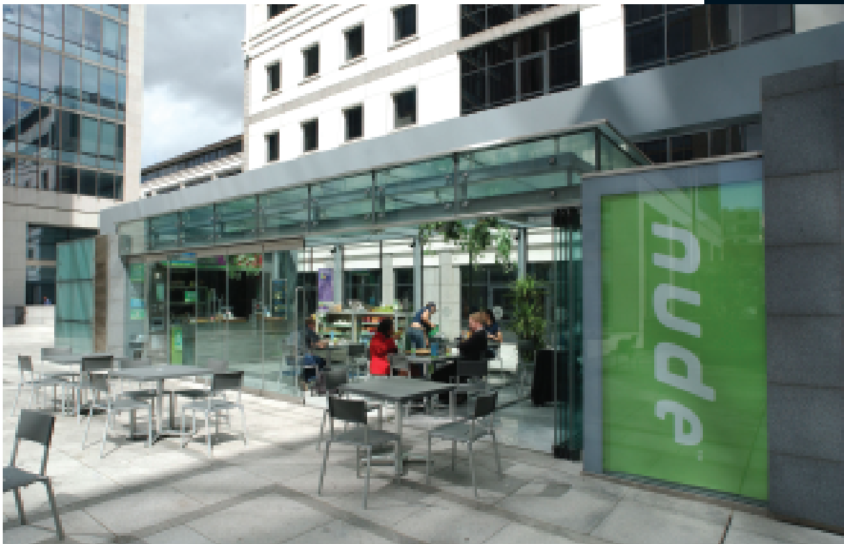
Nude Coffee Shop, Dublin