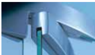
Glas Fittings and Accessories