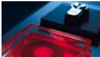
Security/Time and Access (STA)