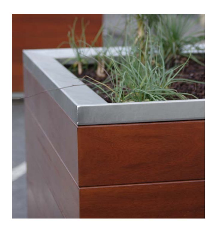
Right, s39 tree planter detail.

Inside the timber cladding is a galvanized steel structure. This is visible at the base of the box. The galvanized coating provides long term corrosion prevention. When corrosion treatment is required remove any surface rust and apply 'cold galvanizing' paint to damaged area. For more information on remedial work contact Omos.