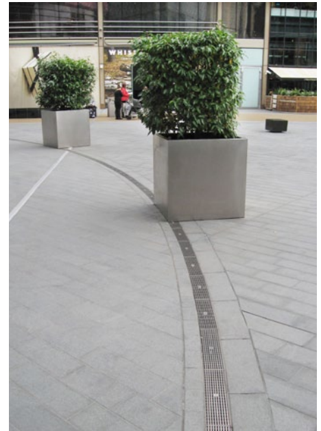
The result has produced strong, precise, accentuated drainage lines that blend perfectly throughout.

Along with the upgraded public transport facilities, shoppers will find the smart new environs of Westfield Stratford City easy to get to and an irresistible place to visit. The attention to detail from the drainage upwards and the sheer scale of redevelopment is raising the profile of this area of East London that is set to attract large numbers of visitors.