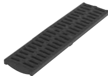
522DL Black Composite Heelguard grating