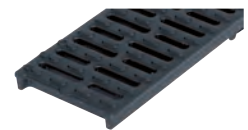
NEW! 23409DL ATec coated Heelguard ductile iron