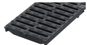
NEW! 23169DL ATec coated Heelguard™ ductile iron