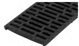
NEW! 23229DL ATec coated Heelguard™ ductile iron

† Not suitable for carriageways of public roads or motorways