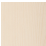
Sycamore Whitenened Oil