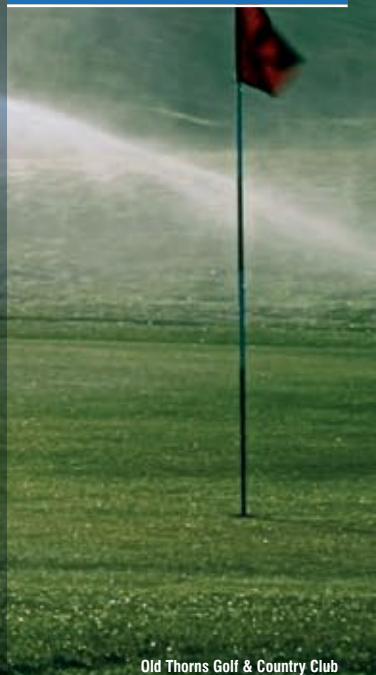
Old Thorns Golf & Country Club