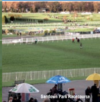
Sandown Park Racecourse