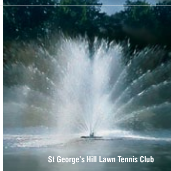
St George's Hill Lawn Tennis Club

This promise to you is supported by over 100 years of experience