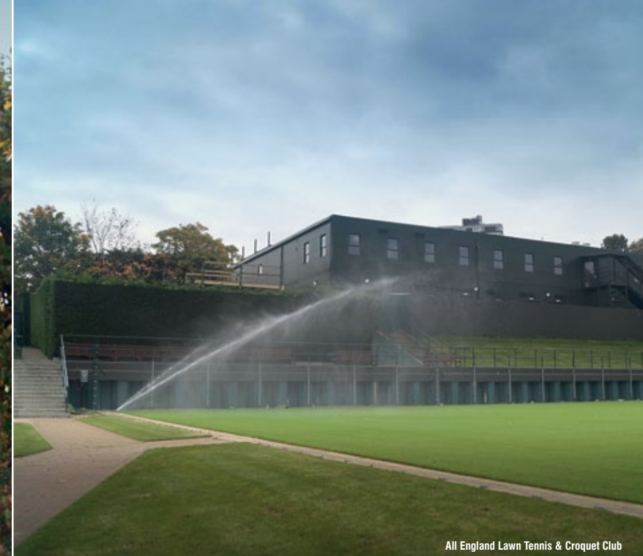
All England Lawn Tennis & Croquet Club