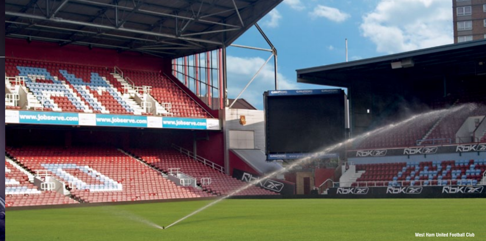
West Ham United Football Club