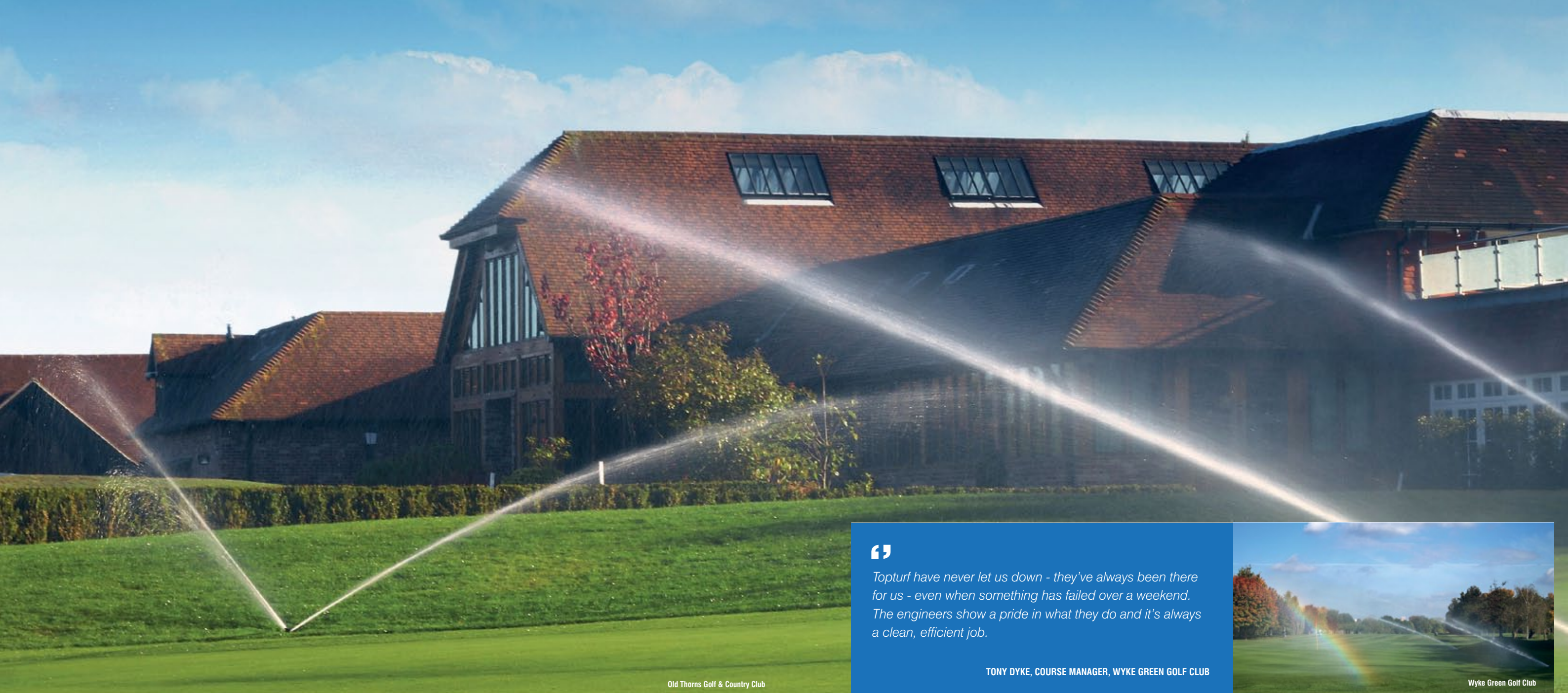
Old Thorns Golf & Country Club