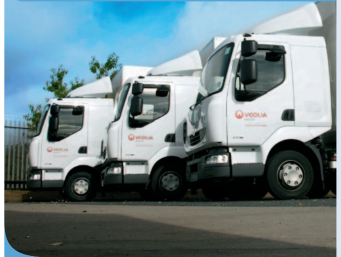
Our own delivery fleet

Our centralised stock holding enables us to offer quick and easy delivery to meet your timescales. By using our route planning technology and own dedicated fleet, we can make just one trip per exchange – supplying and taking away at the same time.