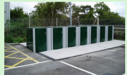
Velo-Safe Lockers at Filton Abbeywood