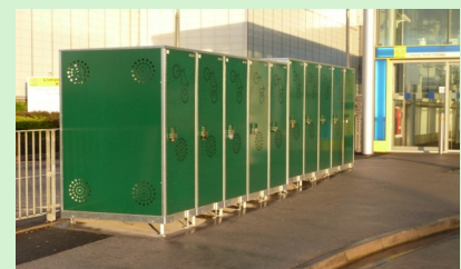
BikeAway Lockers at Liverpool South Parkway