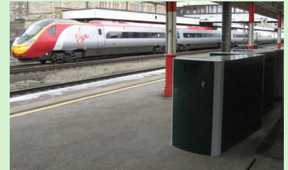
Velo-Safe lockers at Lancaster

Our recently launched locker management service can eliminate the overhead of key management and locker maintenance.