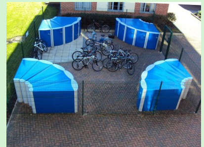
Velo-Safe lockers at Loughborough