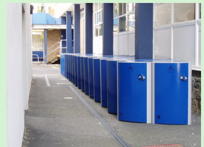
Velo-Safe can turn unused space like this alleyway into useful bike parking.