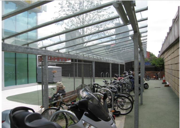
Open access Berlin shelter at Monsoon Headquarters, London