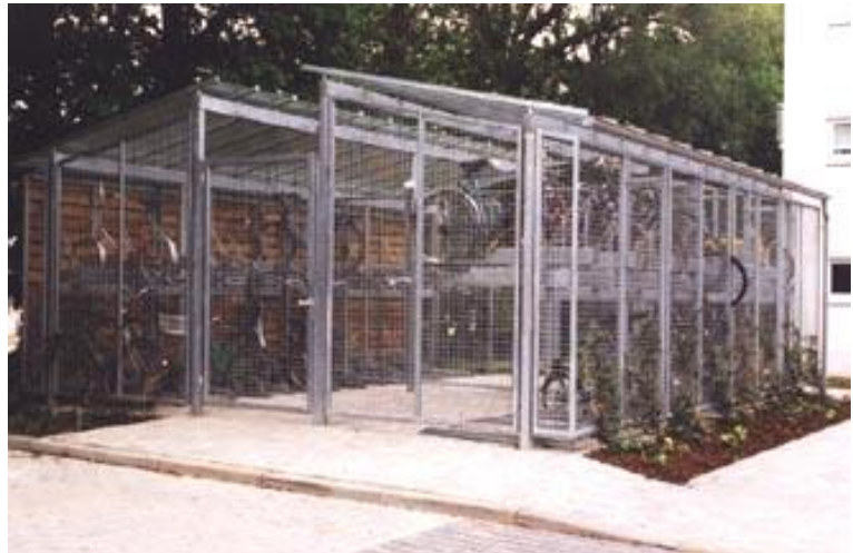
Lockable Berlin compound with mesh cladding, Germany

The Berlin shelter can be supplied with any of our popular rack types, such as the Rounded A rack, the Josta wall rack or one of our feature racks. It can also be used as bin storage or for motorbike or buggy parking.