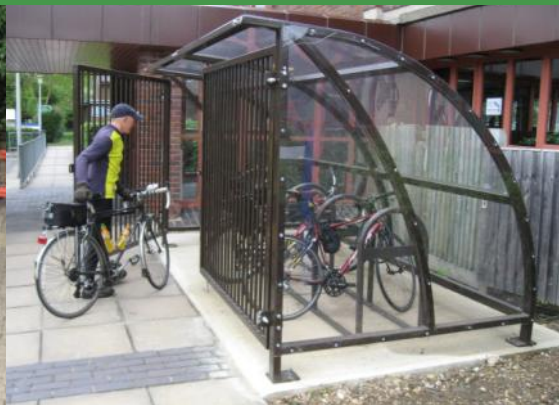
Gated shelter for 10 bikes