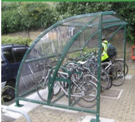
Open access shelter for 10 bikes