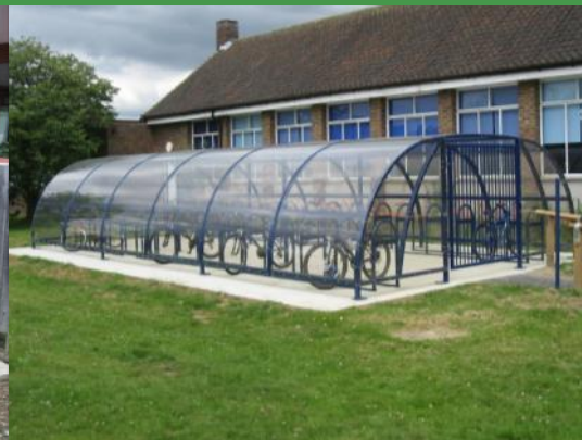
Lockable compound for 60 bikes

The modern and stylish Solent shelter has proved very popular with schools, councils and employers as it combines a sleek rounded design with affordable prices.