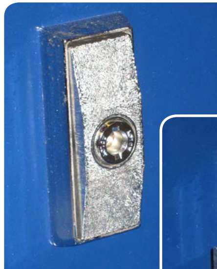
Abloy lock - closed