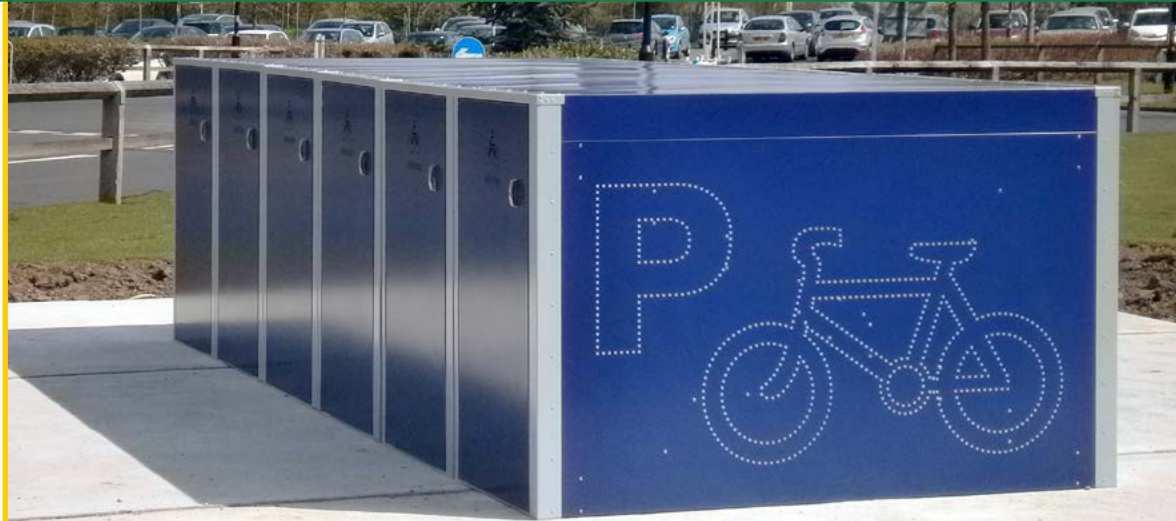
Locker Dimensions: Length 2000 mm, Width: 810 mm, Height: 1300 mm