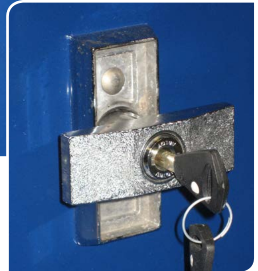
Abloy lock - open