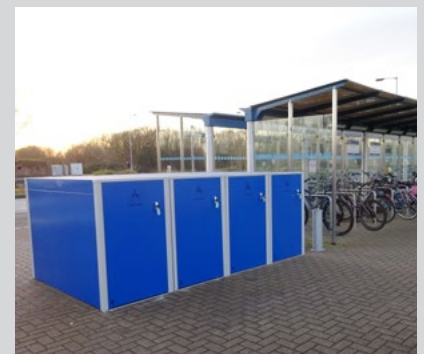
The lockers compliment other bike parking systems at the sites.