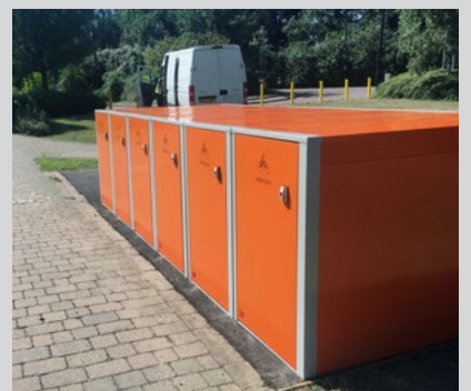
Each site has its own specific colour, tying in with council branding.