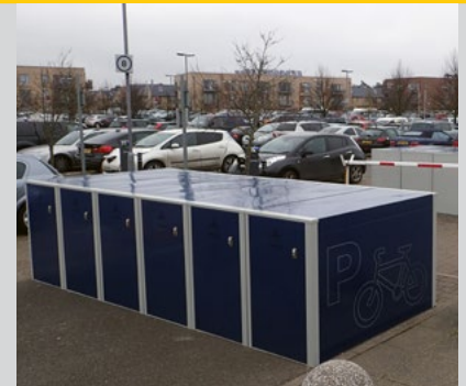
The Velo-Box lockers can be single or double sided.

The lockers are aimed at regular users and promote the integrated use of cycling and buses. This healthy and environmentally friendly way of commuting reduces car journeys, therefore helping to ease road congestion. This coincides with the Cycle-Works ethos of providing environmentally friendly products and services.