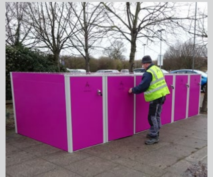
Cycle-Works has its own in-house professional installation team.