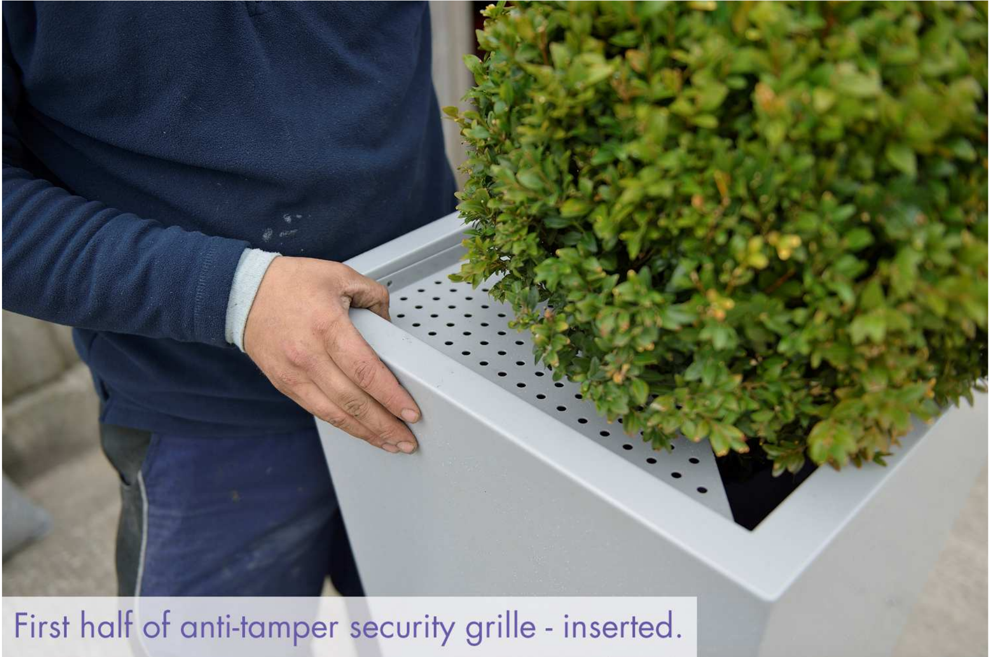
First half of anti-tamper security grille - inserted.