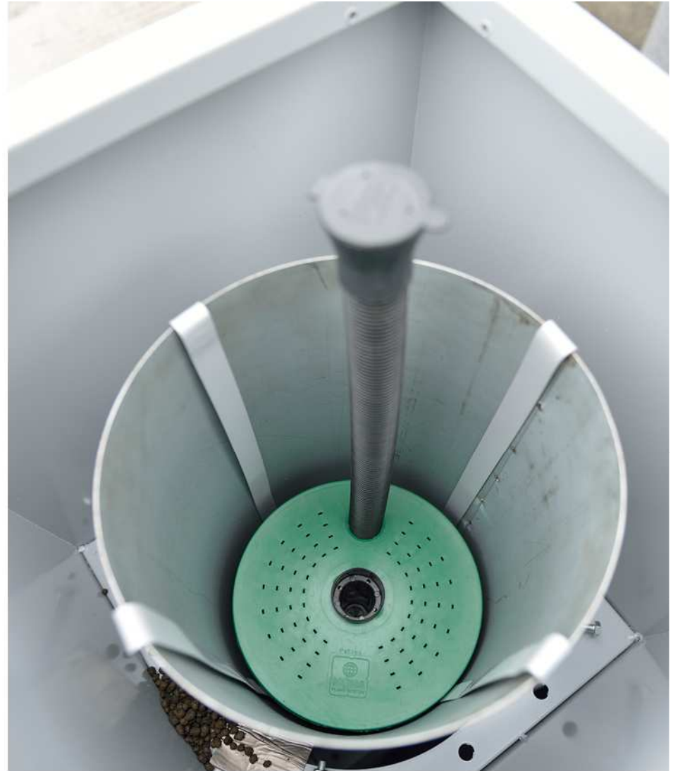
Step 8: Install the self-watering reservoir, placing it into its cradle within the bollard.