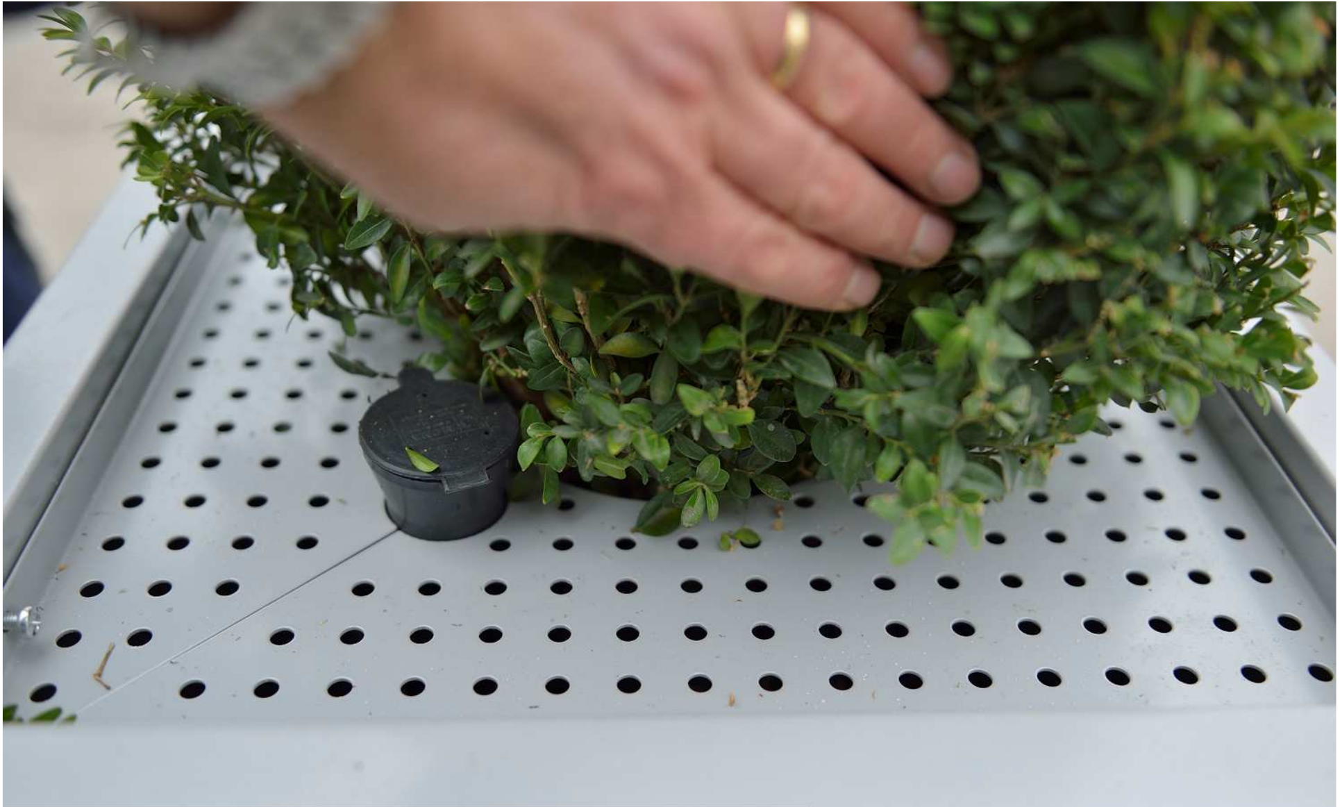
The anti-tamper security grille - installed.