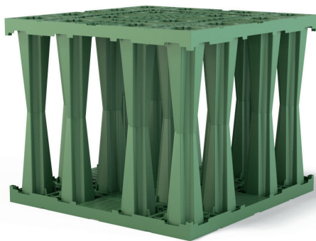
Rigofill® ST full block

Rigofill® light weight stormwater storage and infiltration units are ideal for construction projects where site storage space is limited and reductions in transportation costs can be achieved.