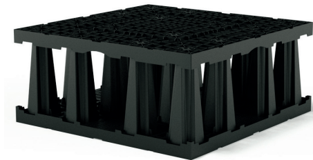
Rigofill® ST-B half block

Rigofill® has a storage volume capacity of over 96% and can accommodate up to three times the amount of water that gravel swales can.