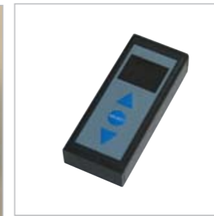
Surface Mounted Switch