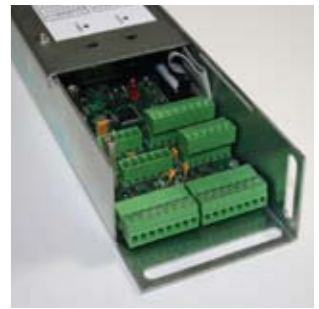
Dedicated Sensor Connections