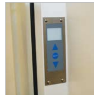
Flush Mounted Switch