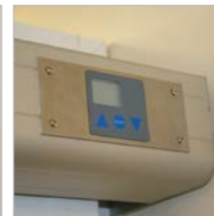
Canopy Mounting Switch