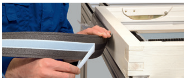
Installation example (1-BT): Fitting wooden windows