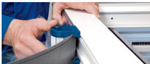
Installation example (CB): Fitting PVC windows

*** Available tape widths correspond to current price lists.