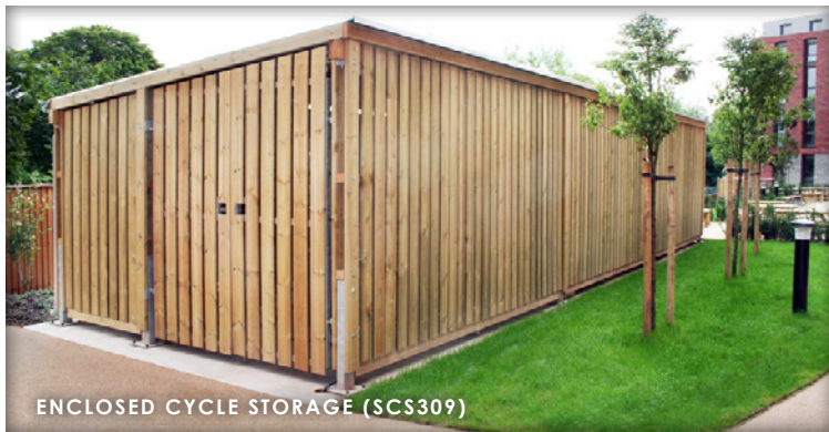
ENCLOSED CYCLE STORAGE (SCS309)