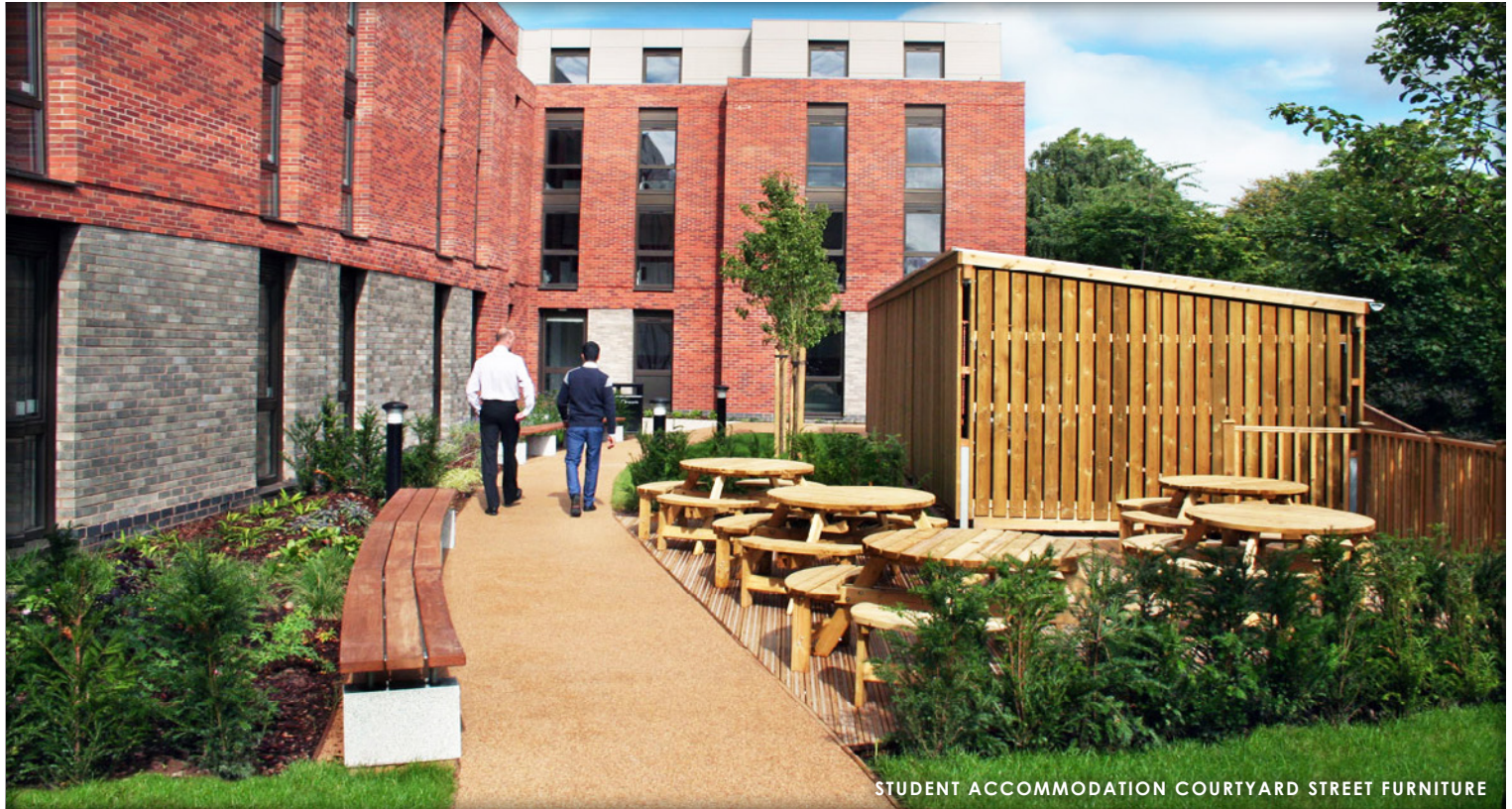
STUDENT ACCOMMODATION COURTYARD STREET FURNITURE