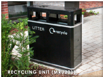
RECYCLING UNIT (MRU201)