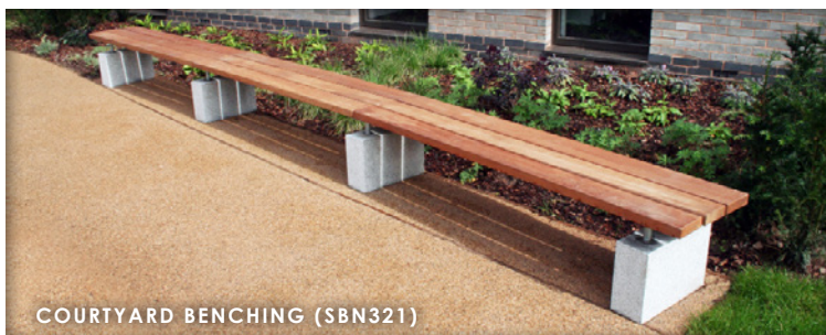
COURTYARD BENCHING (SBN321)

Specialist contractor Torsion Group and Fabrik Landscape Architects had to provide a compact external facility in a tight courtyard space. We were asked to provide a street furniture and cycle storage solution to match this high quality student accommodation project in Birmingham. Collaborating with both parties we managed to achieve the required amount of secure covered cycle parking needed to satisfy planning and link it with the benching and picnic tables for the attractive outdoor area. The plinth mounted benches have a slight curve to follow the flow of the walkway and help enhanced the visual impact of the area.