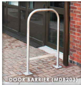
DOOR BARRIER (MDB203)

Project Name: Athena Studios Selly Oak, Birmingham