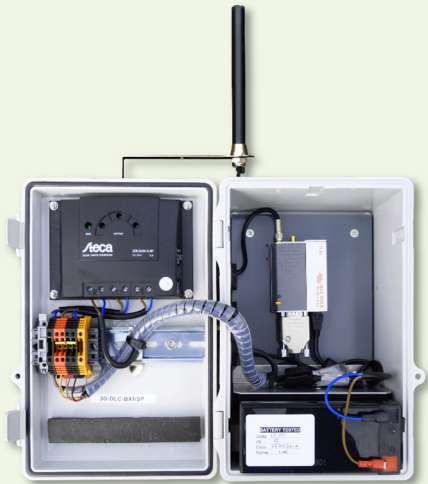
3G-DLC-BX1/SP and 3G-BX1/SP Modem Box

Please note that the logger (ordered separately) has to be mounted outside the modem box. A Data Package is also required to complete the system. To ensure the system meets your needs, please request a quotation before ordering.