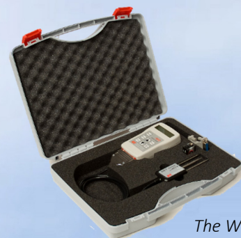
The WET Kit

DELTA-T DEVICES PROVEN APPLICATIONS IN PRECISION HORTICULTURE AND SOIL SCIENCE