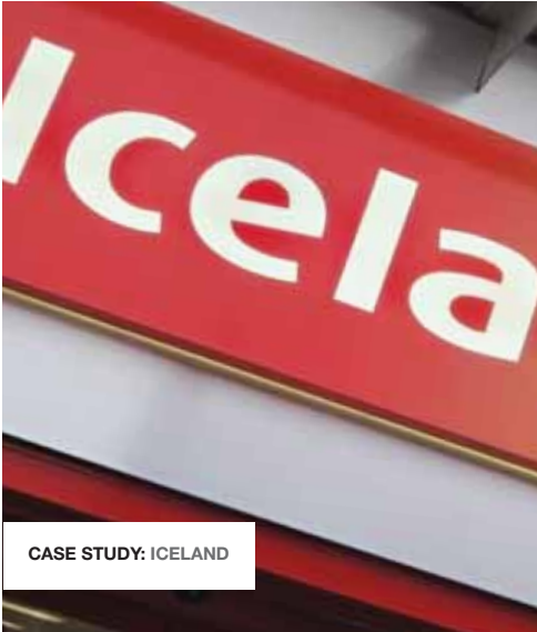
CASE STUDY: ICELAND