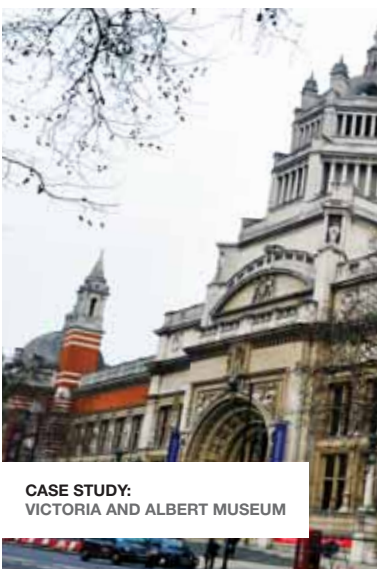
CASE STUDY: VICTORIA AND ALBERT MUSEUM