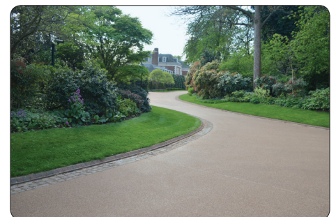
Winfield House: US Ambassador's Residence, Regents Park, London