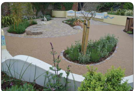
Winceling Sensory Garden: Lancing, Sussex