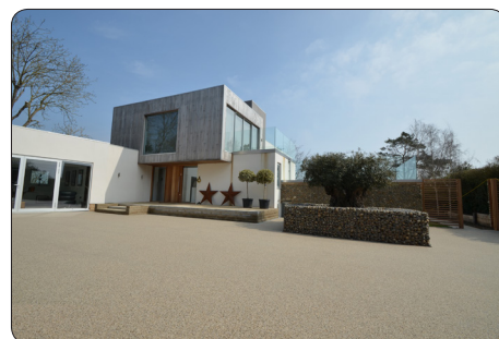
Salt House: Installation for Frost Landscapes. Norfolk.