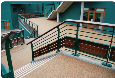
Wimbledon AELTA: Press area private roof terrace and steps. Wimbledon, London