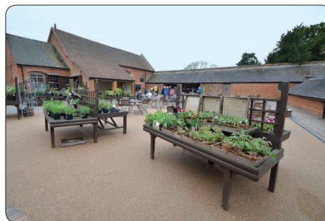
National Trust Badlesley Clinton: Courtyard outdoor restaurant seating area. Warwickshire.