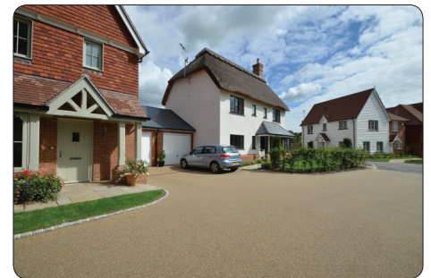
Berkeleys Homes: The Ashmiles, roadway and paths for new build homes, Barns Green, West Sussex.