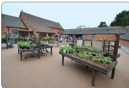
National Trust Baddesley Clinton: Courtyard outdoor restaurant seating area. Warwickshire.