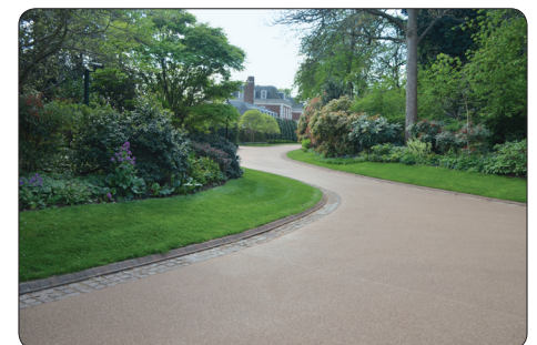
Winfield House: US Ambassador's Residence, Regents Park, London