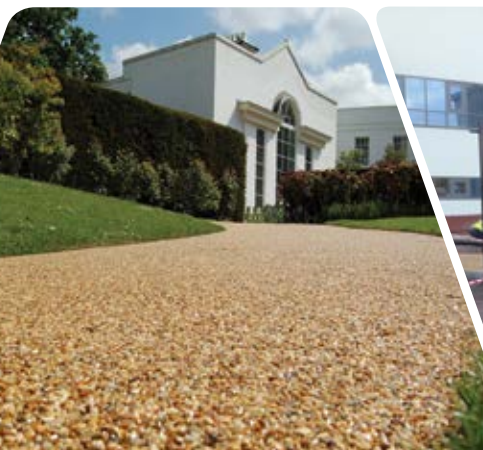
Pathways Royal Ballet school, Richmond Park, London