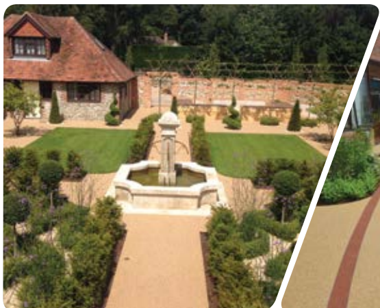
Resin bound pathways, Elizabethan Style Garden