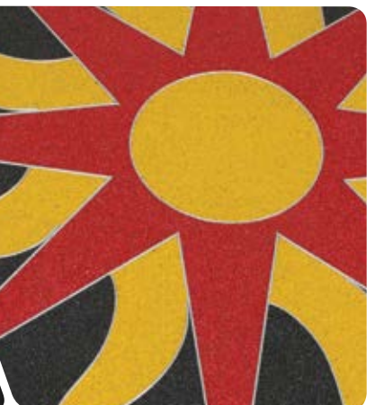
Prismstone Star Burst