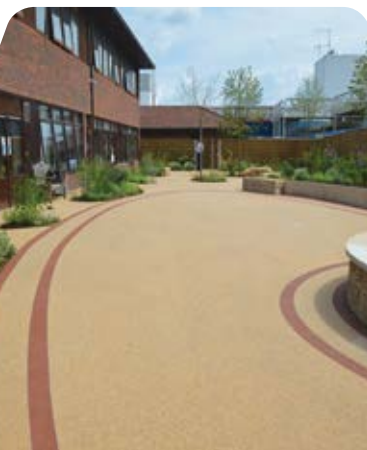
Horatio's Garden, Stoke Mandeville Hospital