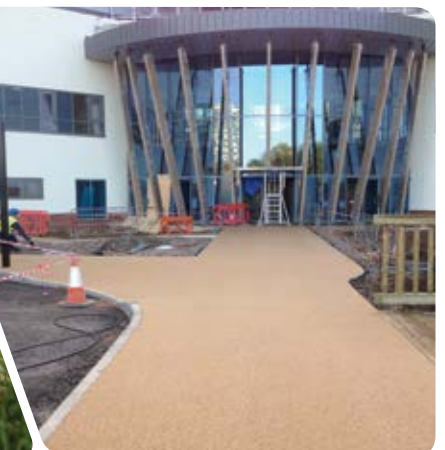
Middlesex Hospital new entrance