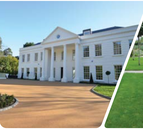
Private Driveway, London