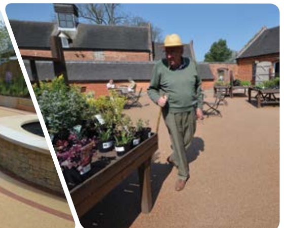
Courtyard National Trust's Baddesley Clinton