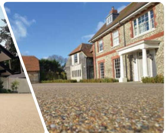
Private driveway, Sussex