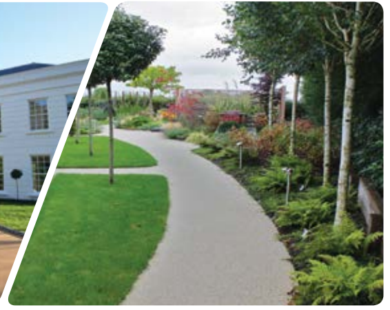
Garden pathways private home