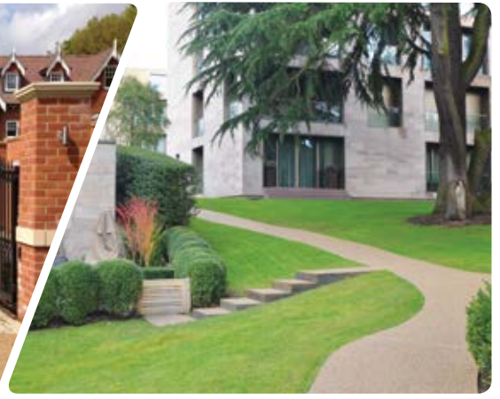
Pathways private estate, London