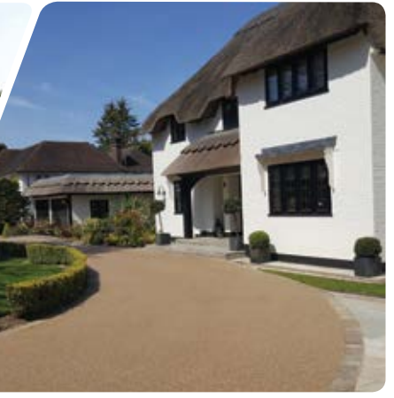
Private driveway, period thatch cottage, Kent