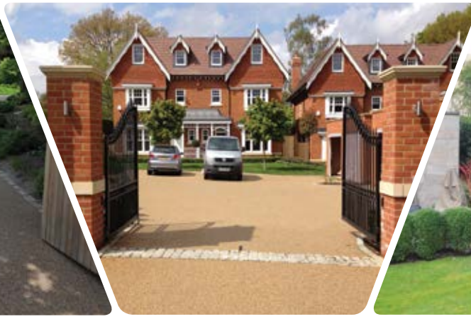
Carpark for new build development, Esher