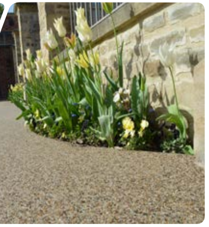
Private Driveway, Oxfordshire