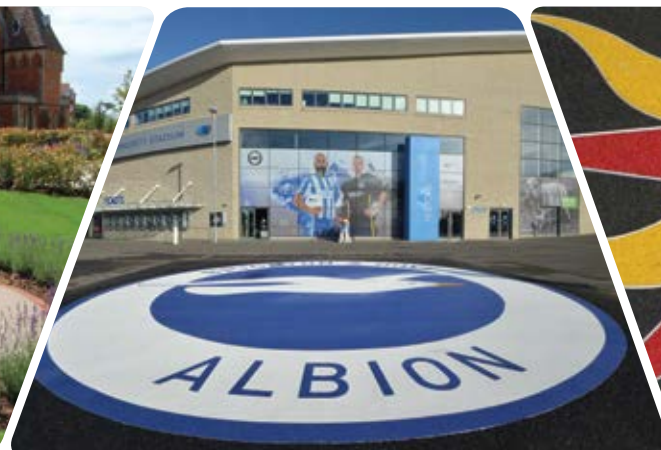
Prismstone Seagull Crest B&H Albion FC, Amex Community Stadium