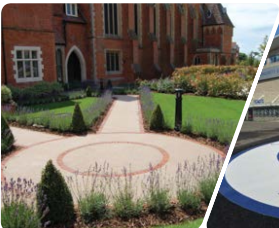
All Saints conversion for Berkeley Homes, Eastbourne

For more information about our Colour Ranges visit clearstonepaving.co.uk