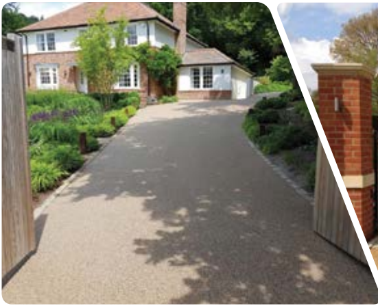
Private driveway, Kent