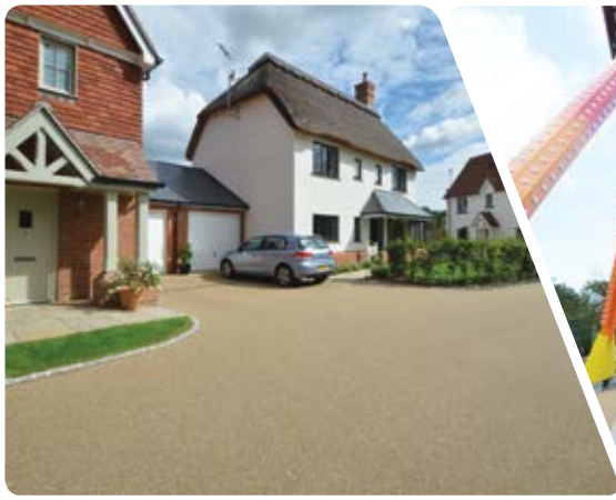
Berkeley Homes, The Ashmiles, Barns Green, Sussex