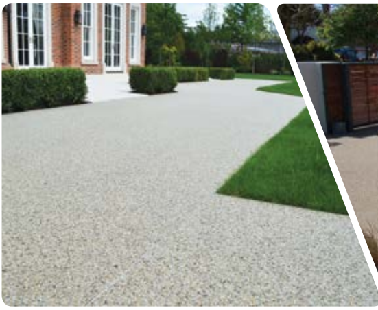
Private Terrace and Paths, Wentworth