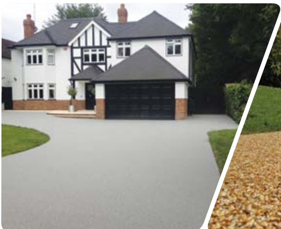
Private Driveway, East Sussex