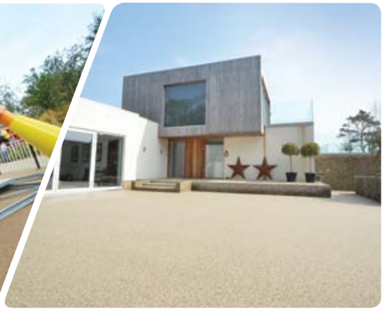
Private driveway, contemporary home