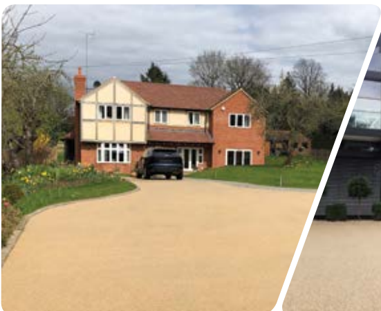
Private Driveway, Henley-on-Thames

Standard Colour Range available October 2018