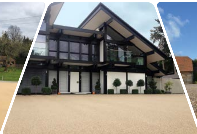
Private driveway, Huff House, Surrey