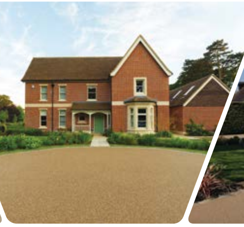
Private driveway, Bali award winning garden