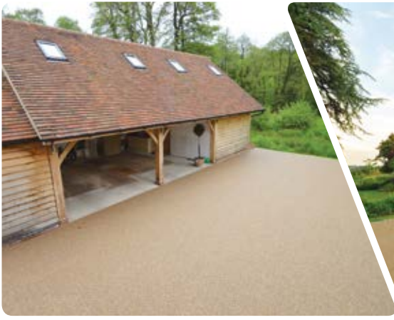
Private driveway, barn conversion, Hampshire