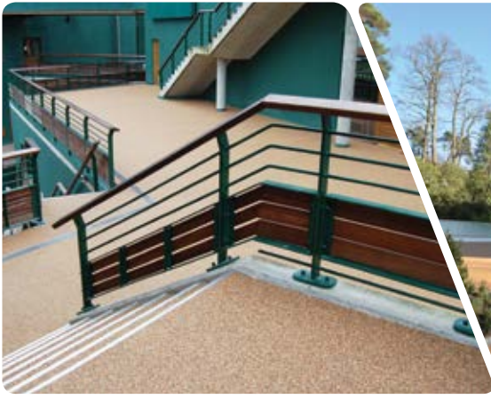
Terrace and stairs Wimbledon Tennis Club, Wimbledon