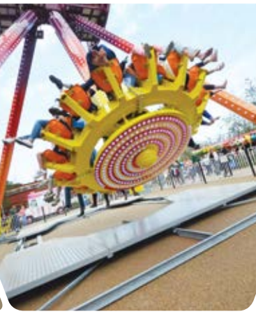
Pendulum ride, Dreamland, Margate