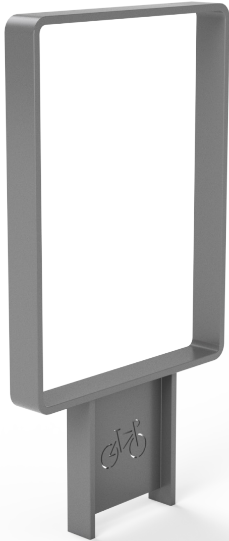
Murton Cycle Stand