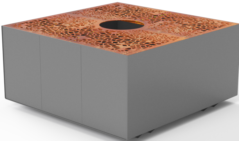
Osso Planter (1.5x1.5x0.75m)