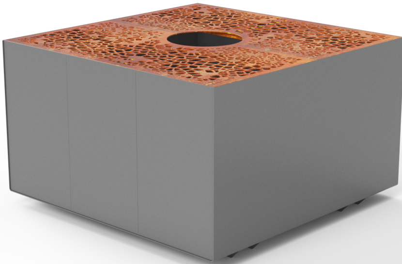
Osso Planter (1.5x1.5x0.9m)