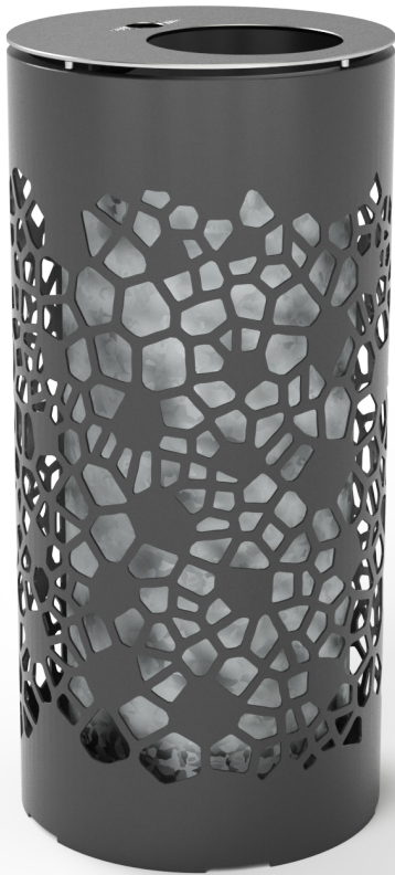
Osso Bin (Small)