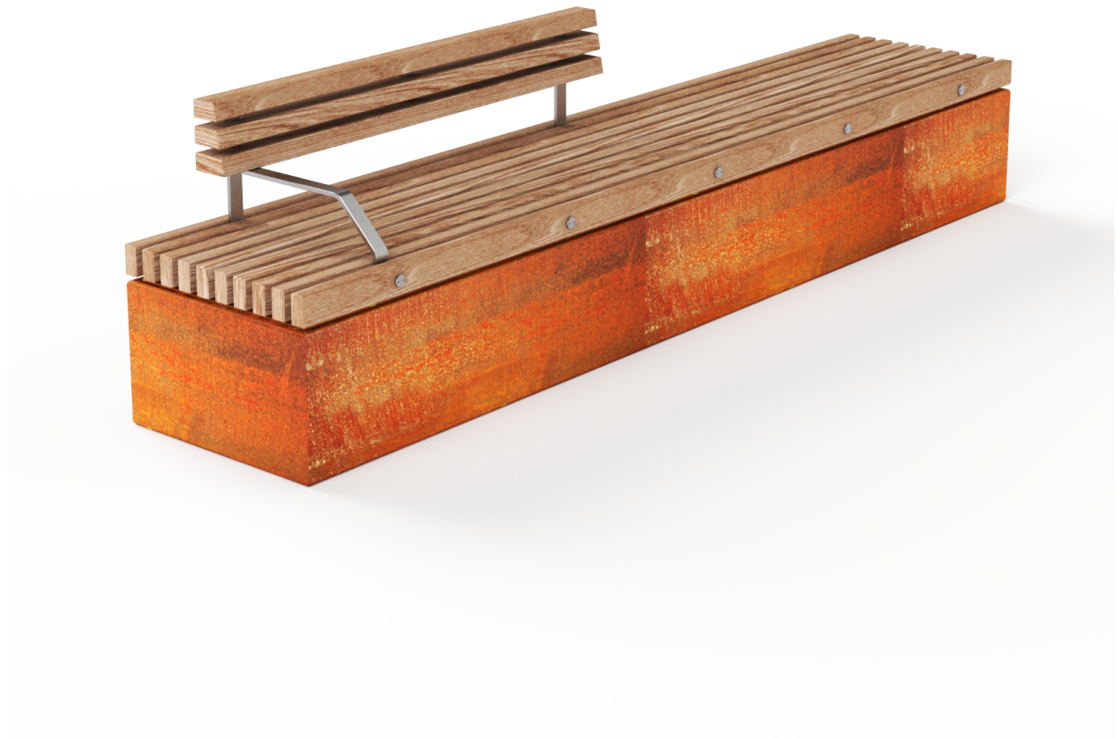
Soca Steel Seat - 3m