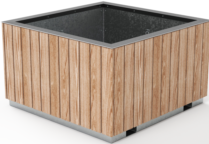
Tree Planter (1.5m)